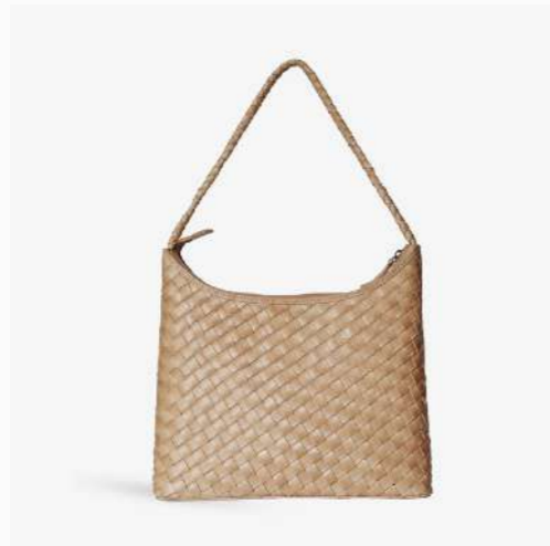
MARNI BAG Large in Caramel