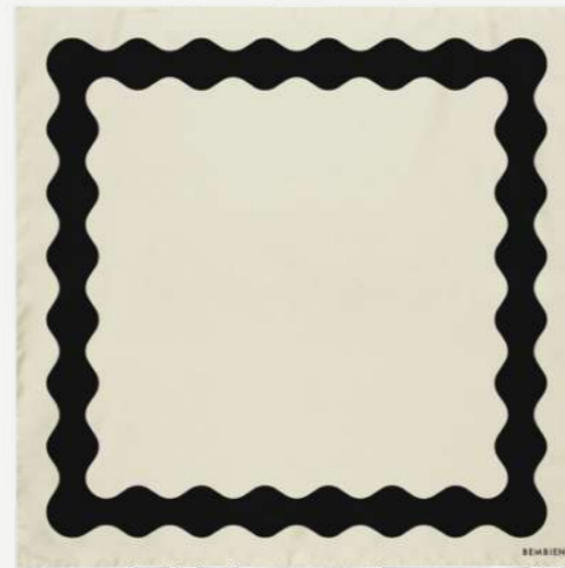
BOULE Scarf in Cream