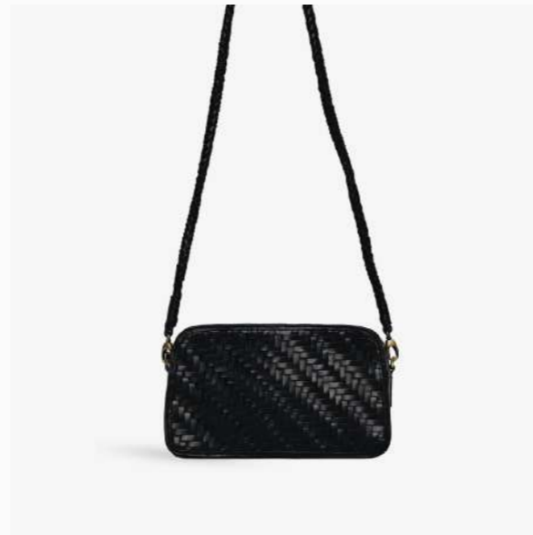
EDIE CROSSBODY in Black