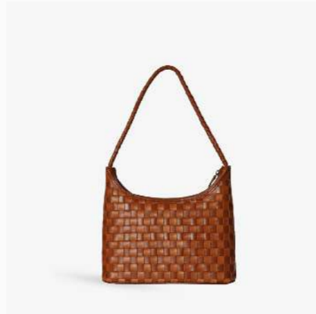
MARNI BAG Small in Sienna x Copper Check