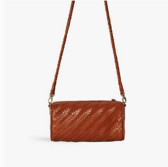
GIGI CROSSBODY in Sienna