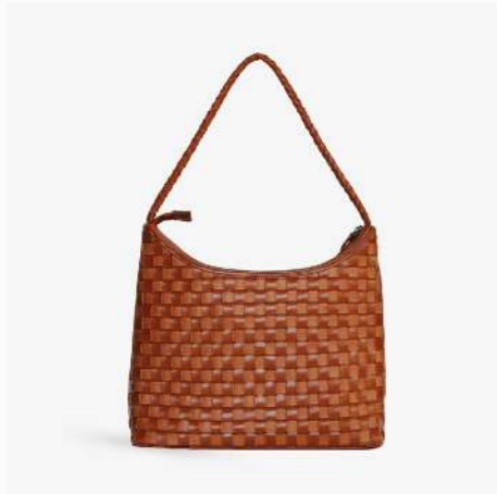
MARNI BAG Large in Sienna x Copper Check