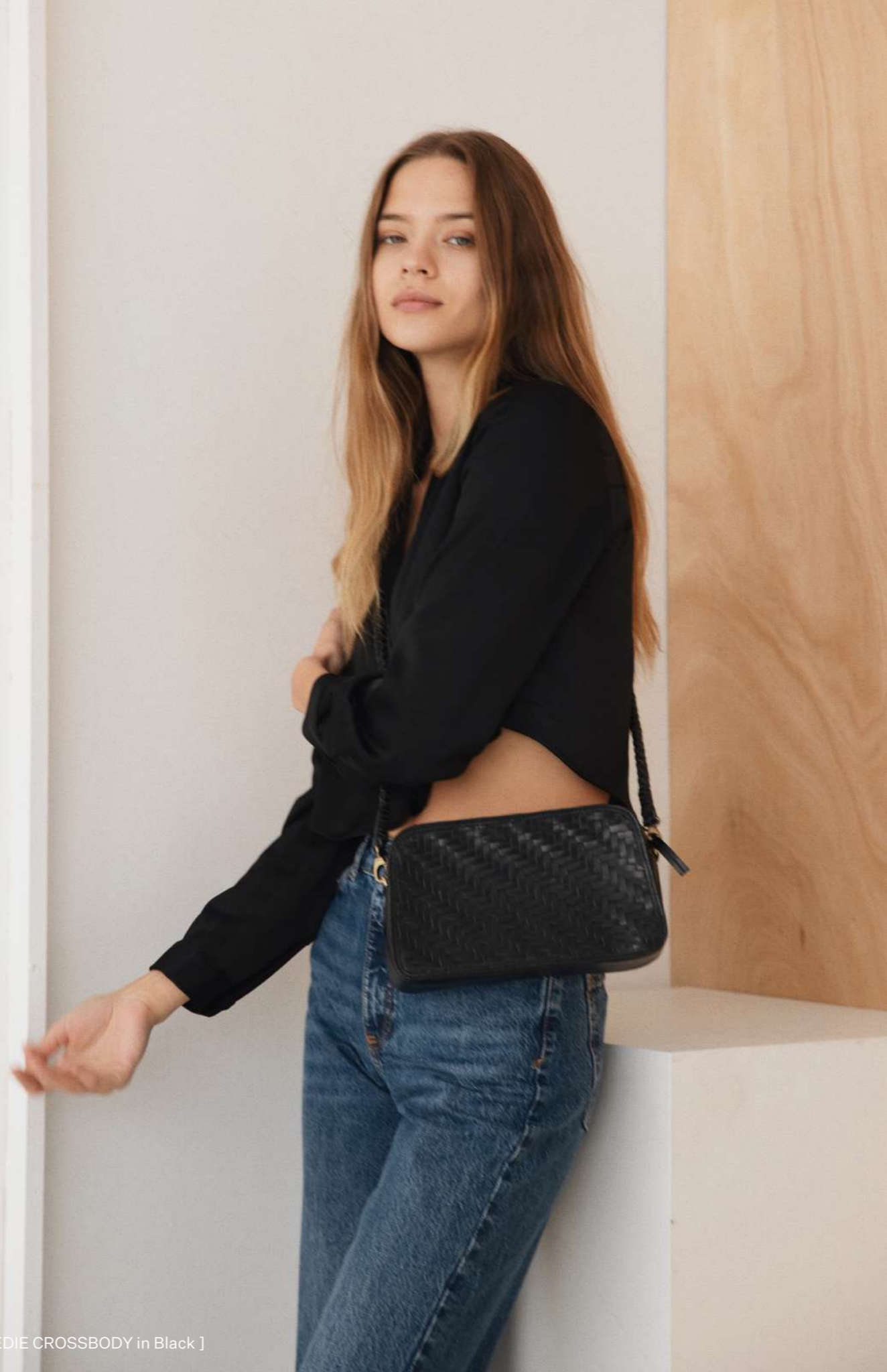
[ EDIE CROSSBODY in Black ]