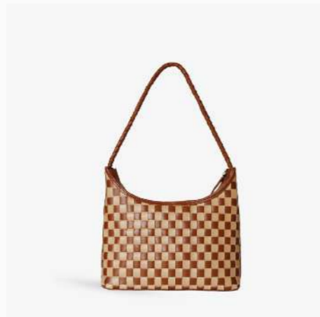
MARNI BAG Small in Caramel x Sienna Check