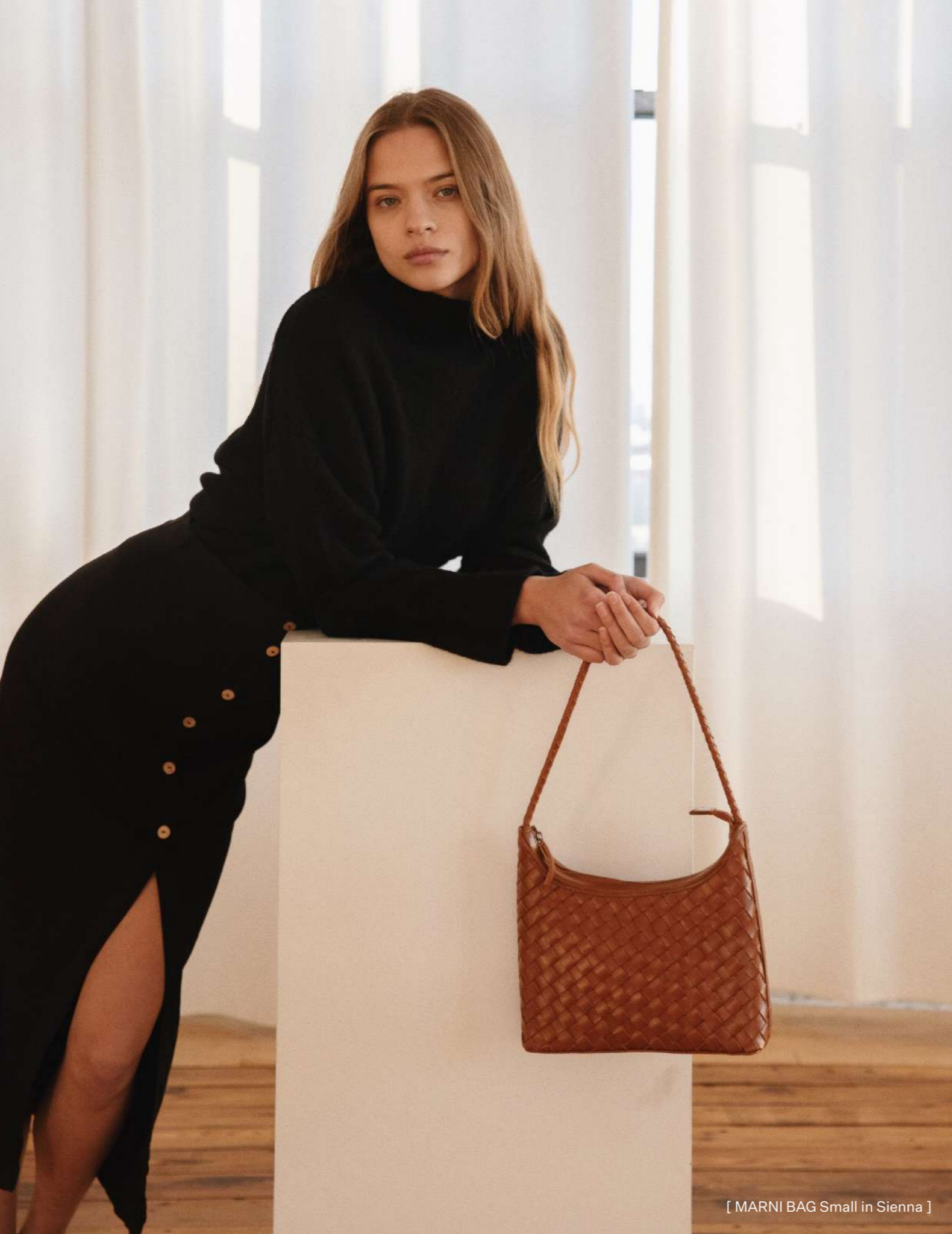
[ MARNI BAG Small in Sienna ]