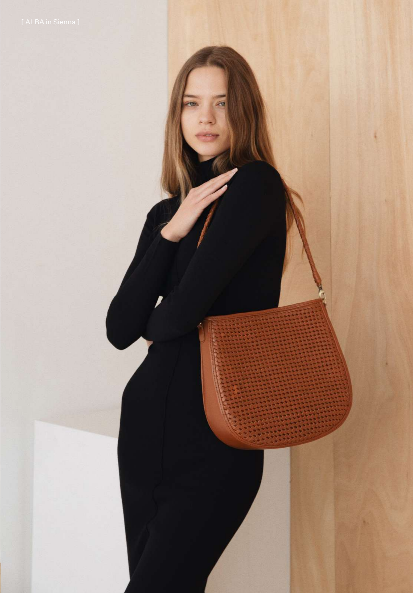
[ ALBA in Sienna ]