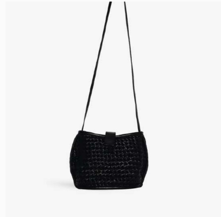
PAOLA CROSSBODY in Knotted Weave Black