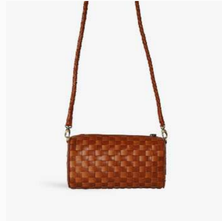
GIGI CROSSBODY in Sienna x Copper Check