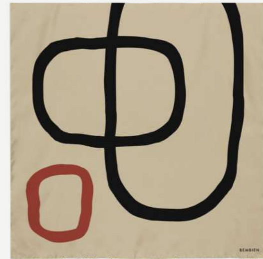
DECO Scarf in Beige