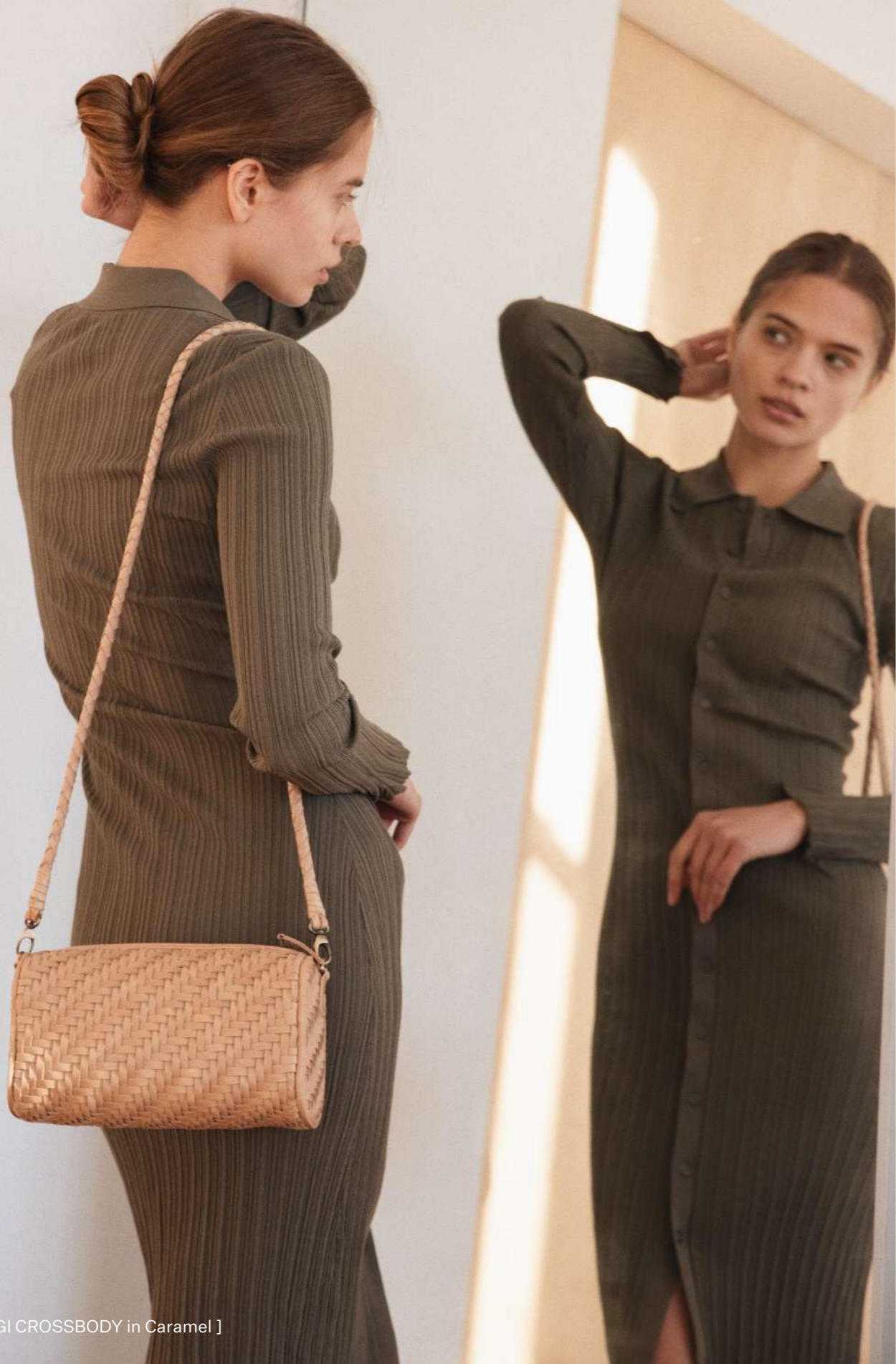
[ GIGI CROSSBODY in Caramel ]