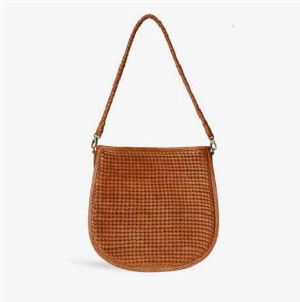
ALBA in Copper