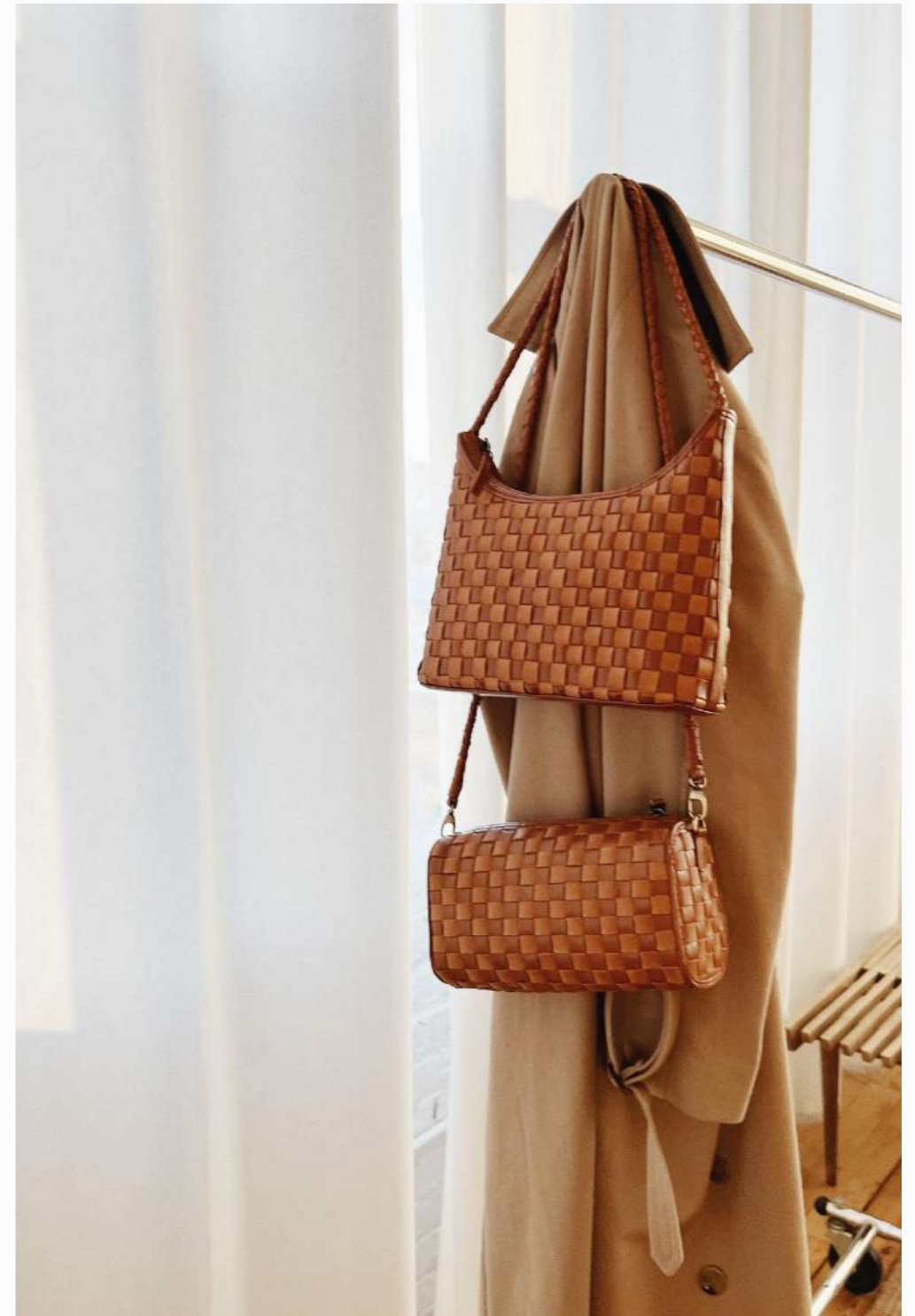
[ MARNI BAG Small and GIGI Crossbody in Sienna x Copper Check ]