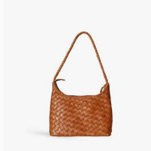
MARNI BAG Small in Copper