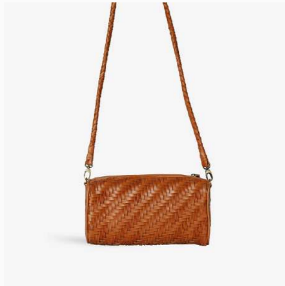
GIGI CROSSBODY in Copper