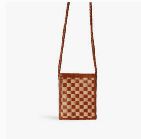
PORTA CROSSBODY in Caramel x Sienna Check