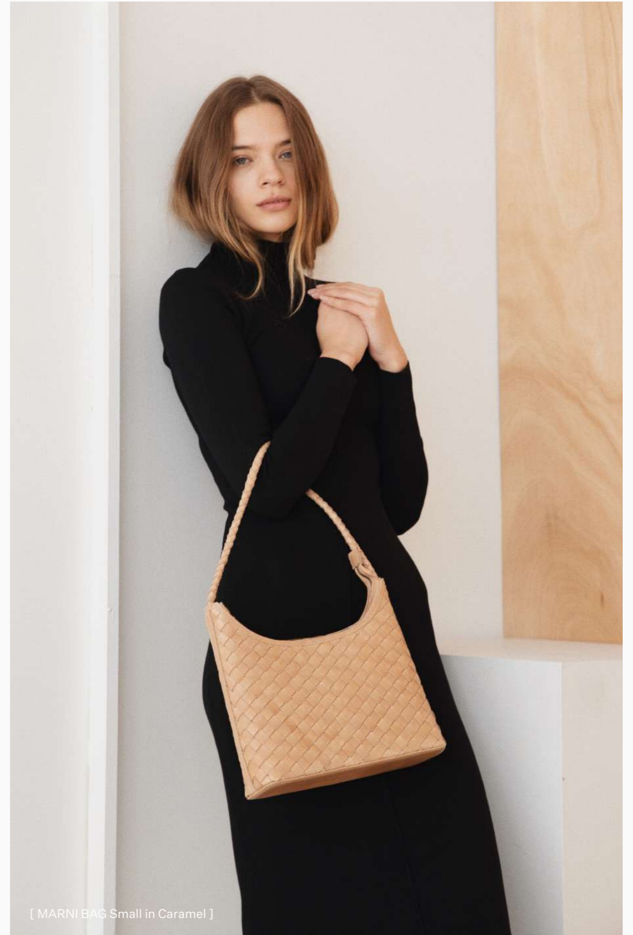
[ MARNI BAG Small in Caramel ]