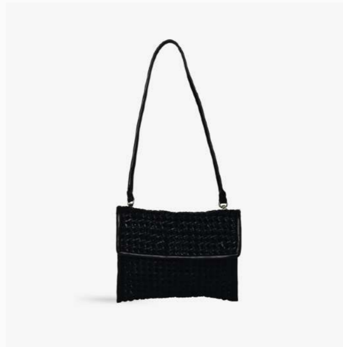
LARITA CLUTCH in Knotted Weave Black