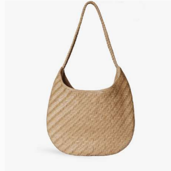
BOBBIE BAG in Caramel