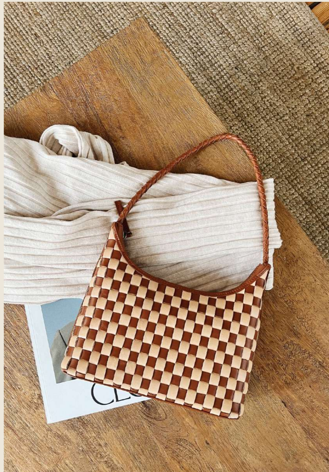
[ MARNI BAG Small in Caramel x Sienna Check]