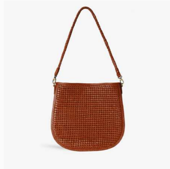
ALBA in Sienna