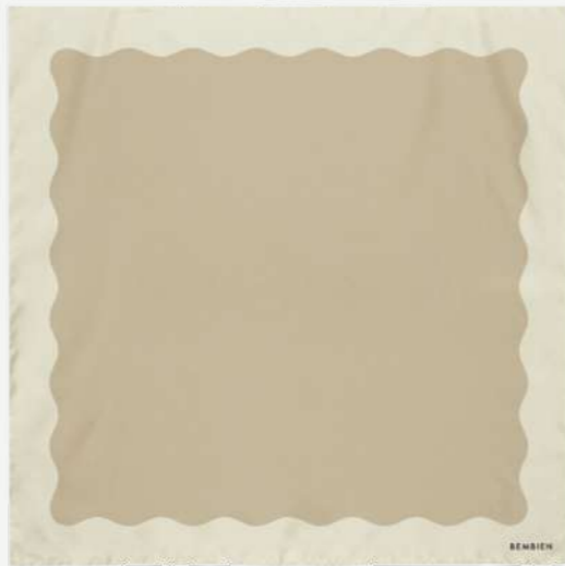
BOULE Scarf in Beige