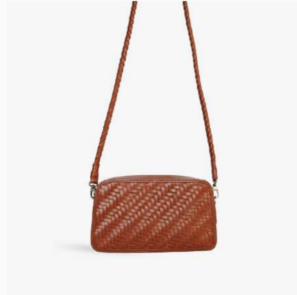
EDIE CROSSBODY in Sienna