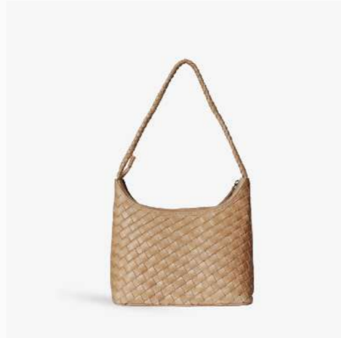
MARNI BAG Small in Caramel