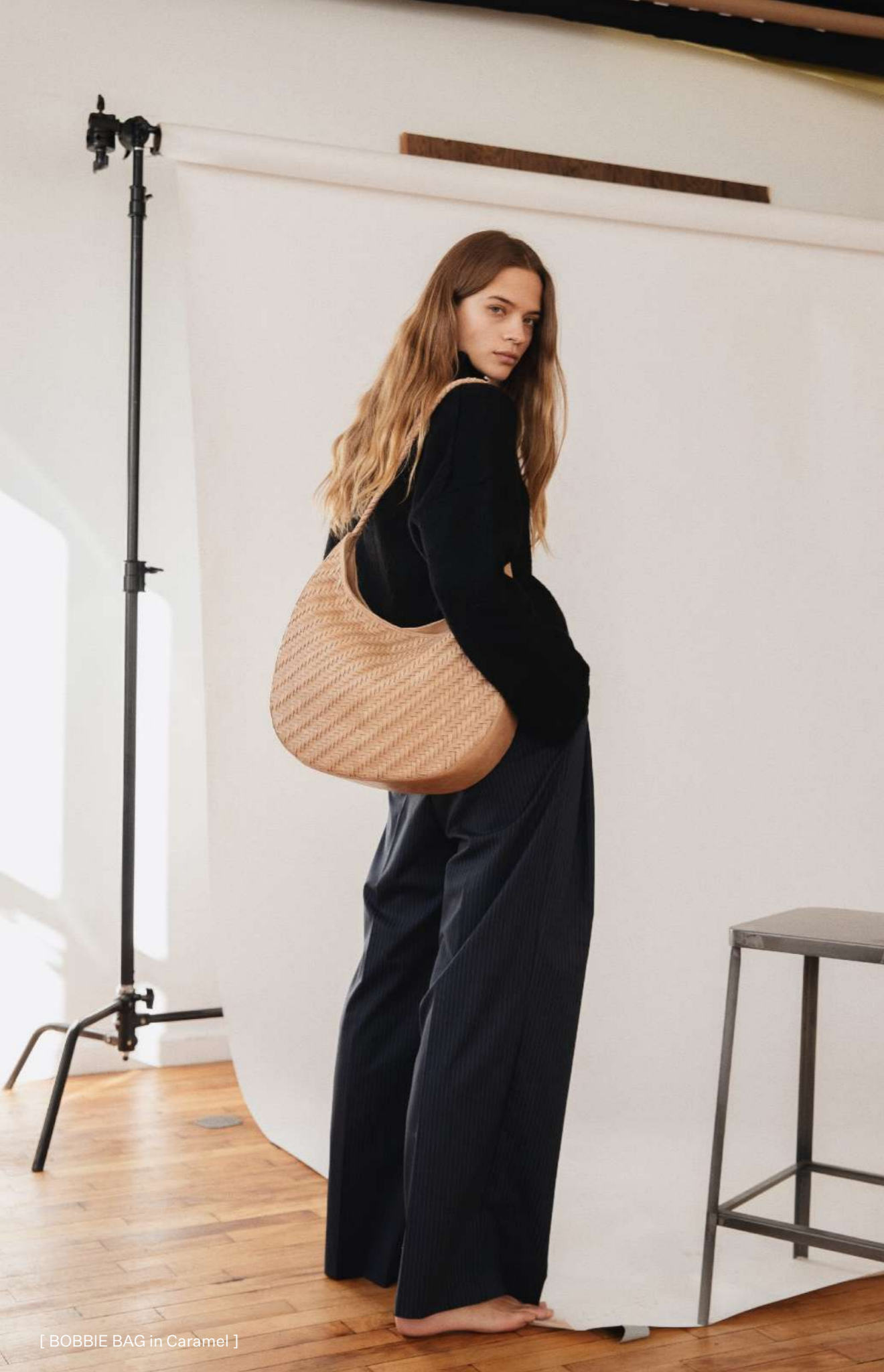
[ BOBBIE BAG in Caramel ]