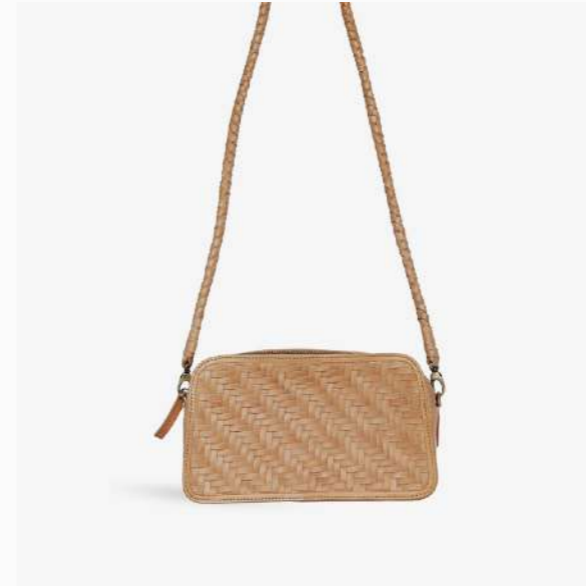
EDIE CROSSBODY in Caramel