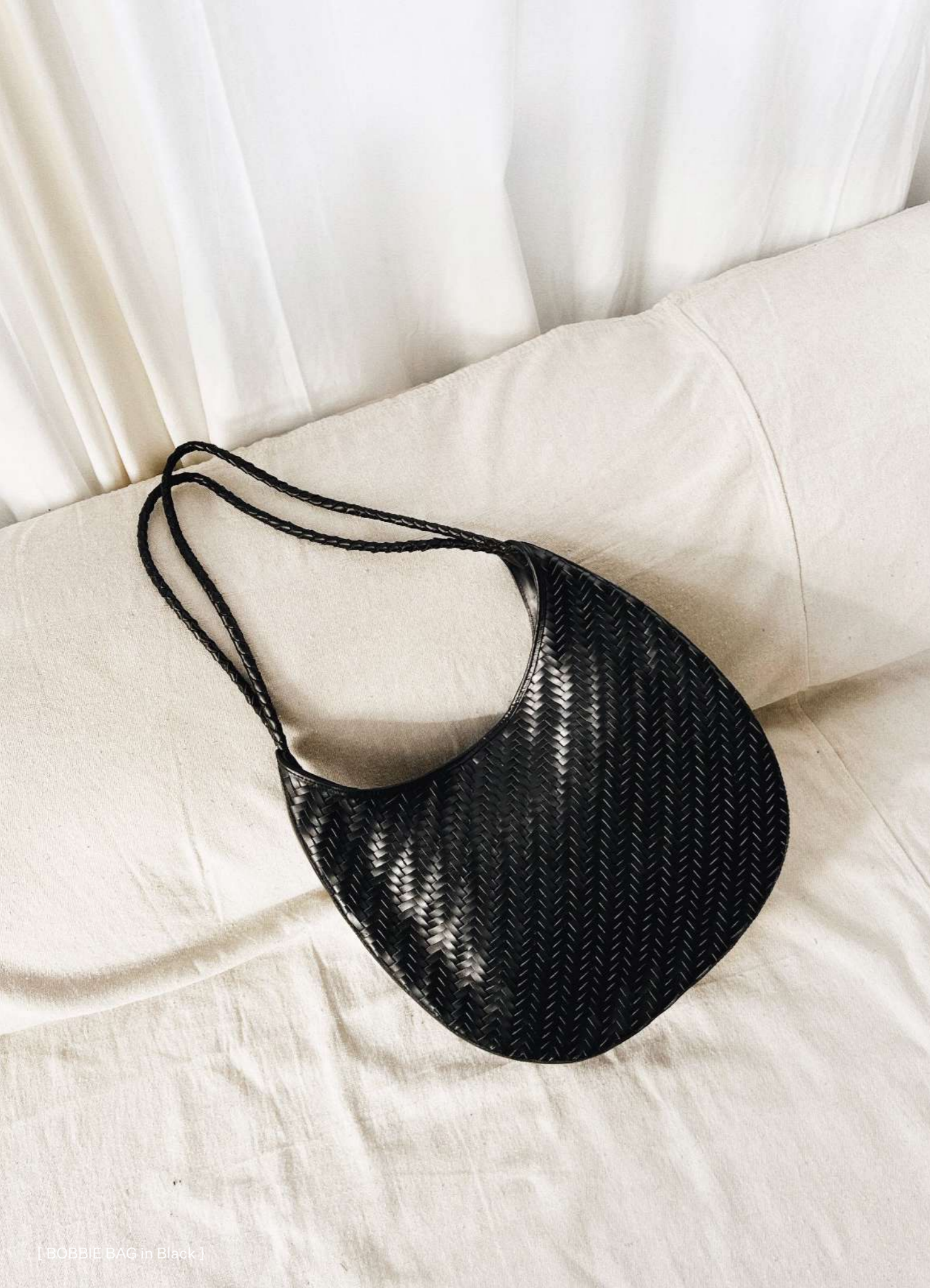
[BOBBIE BAG in Black]