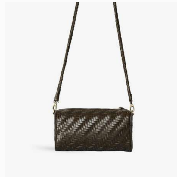
GIGI CROSSBODY in Olive