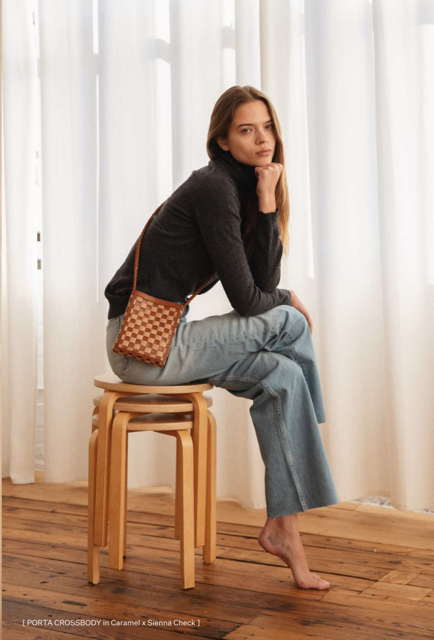
[ PORTA CROSSBODY in Caramel x Sienna Check ]