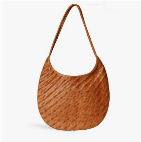
BOBBIE BAG in Copper