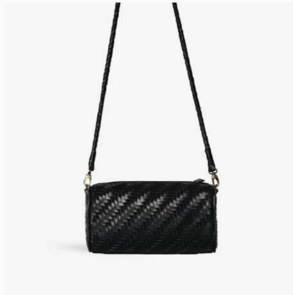
GIGI CROSSBODY in Black