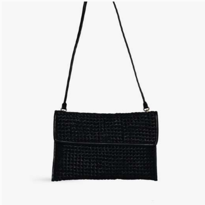
LARA CLUTCH in Knotted Weave Black

Previously offered only in rattan, our best-selling styles from Spring are now available in a luxurious soft woven leather