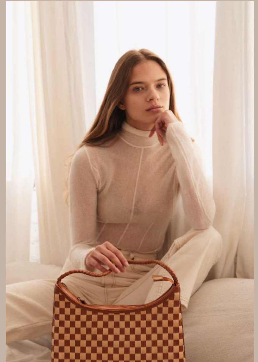
[ MARNI BAG Large in Caramel x Sienna Check ]