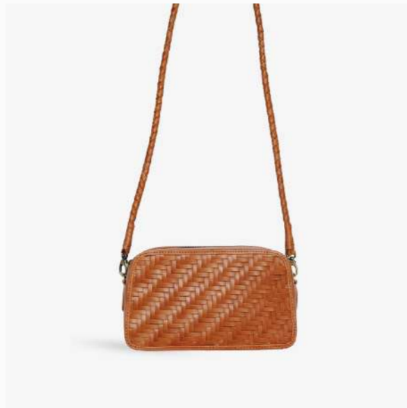
EDIE CROSSBODY in Copper