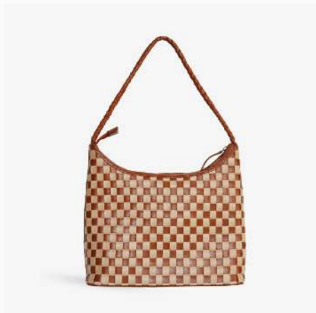
MARNI BAG Large in Caramel x Sienna Check