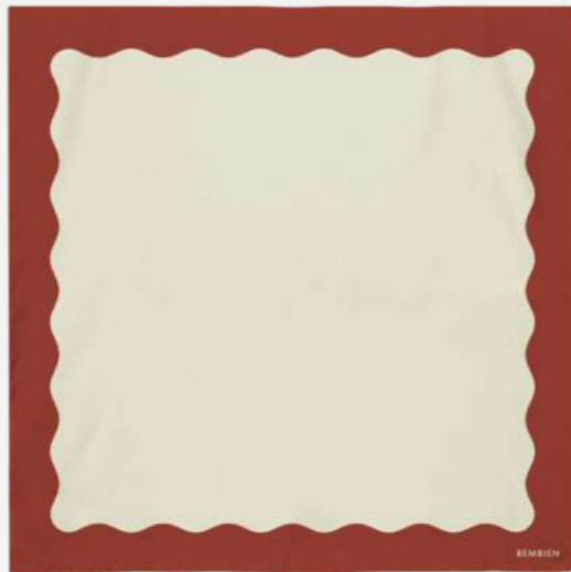
BOULE Scarf in Red