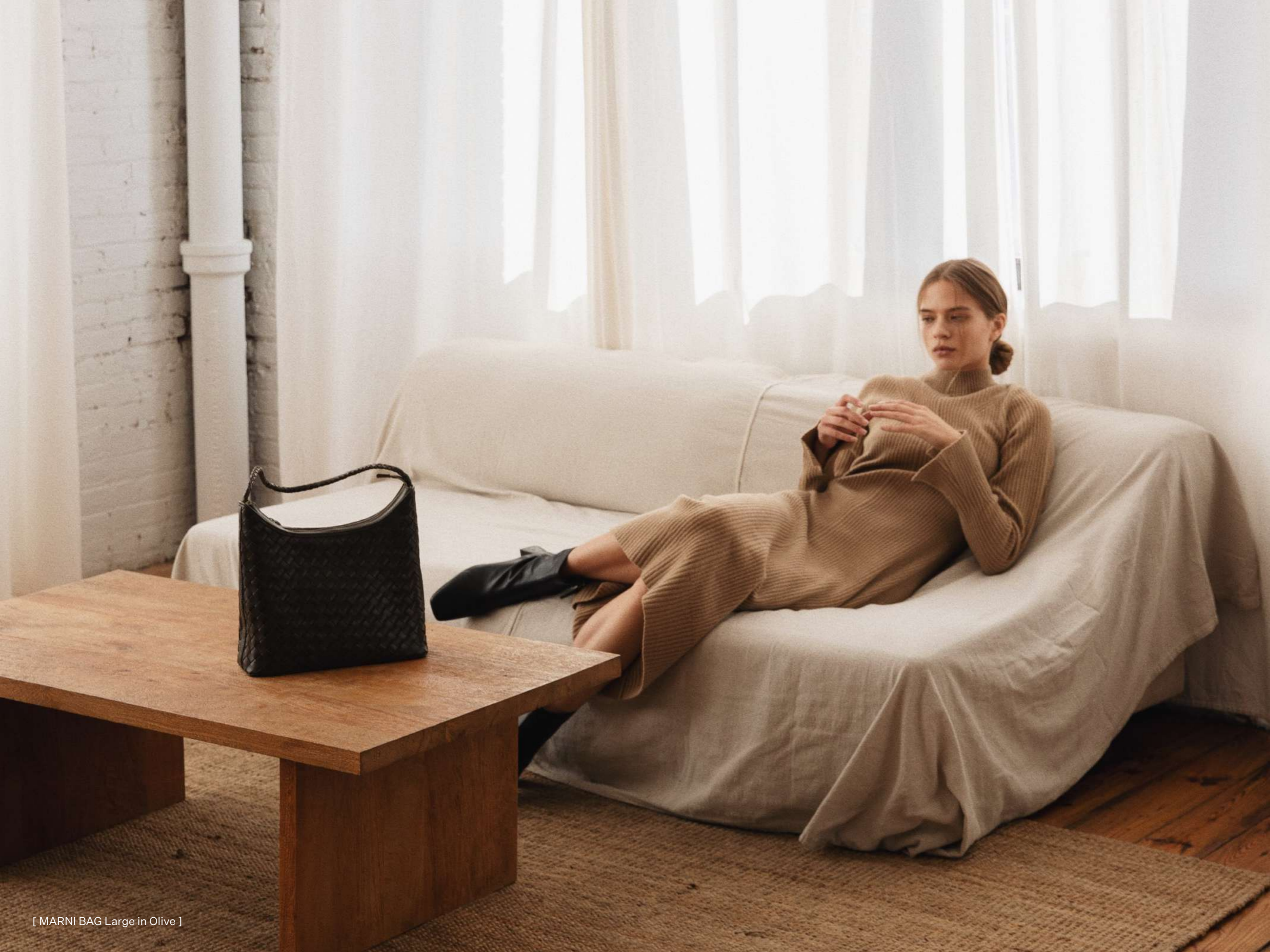
[ MARNI BAG Large in Olive ]