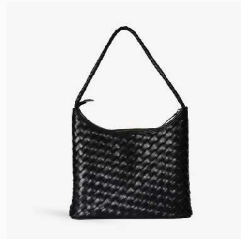
MARNI BAG Large in Black