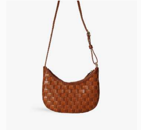
MINI SLING in Sienna x Copper Check