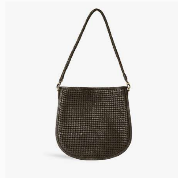
ALBA in Olive