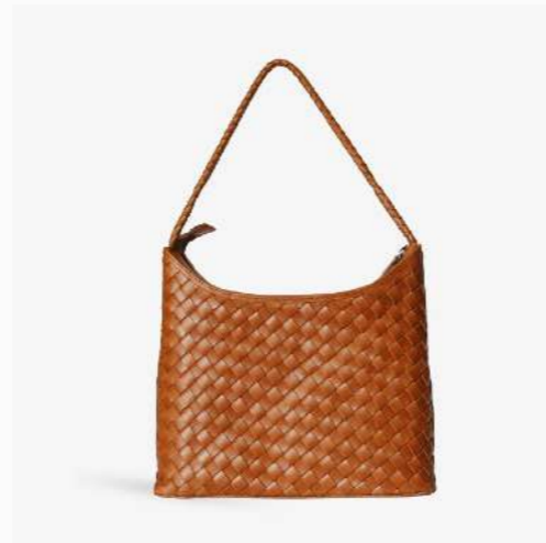
MARNI BAG Large in Copper