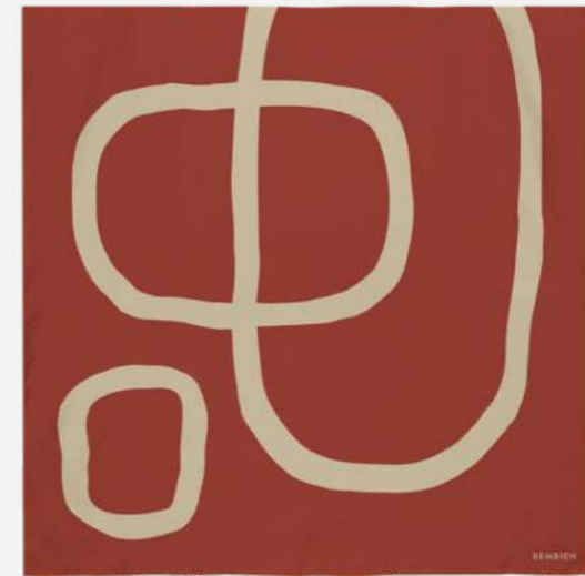
DECO Scarf in Red