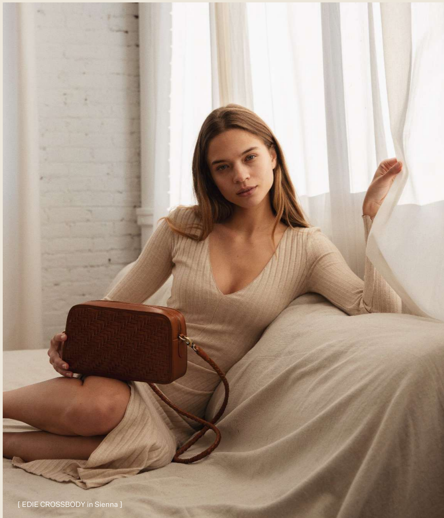
[ EDIE CROSSBODY in Sienna ]

The perfect everyday crossbody. Introducing: EDIE