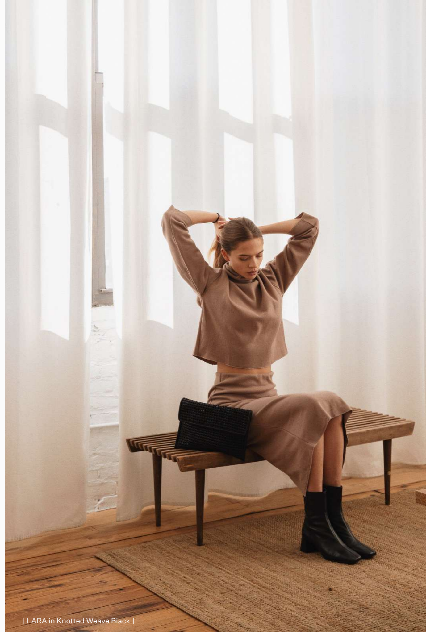
[ LARA in Knotted Weave Black ]