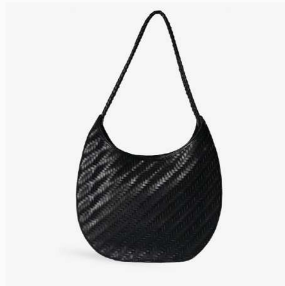
BOBBIE BAG in Black