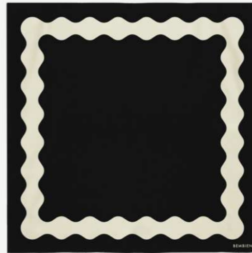
BOULE Scarf in Noir