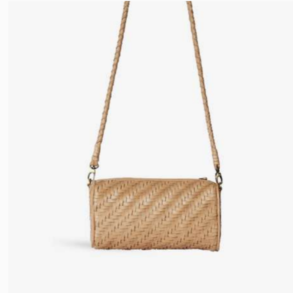
GIGI CROSSBODY in Caramel