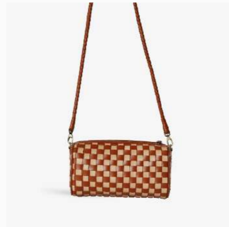
GIGI CROSSBODY in Caramel x Sienna Check