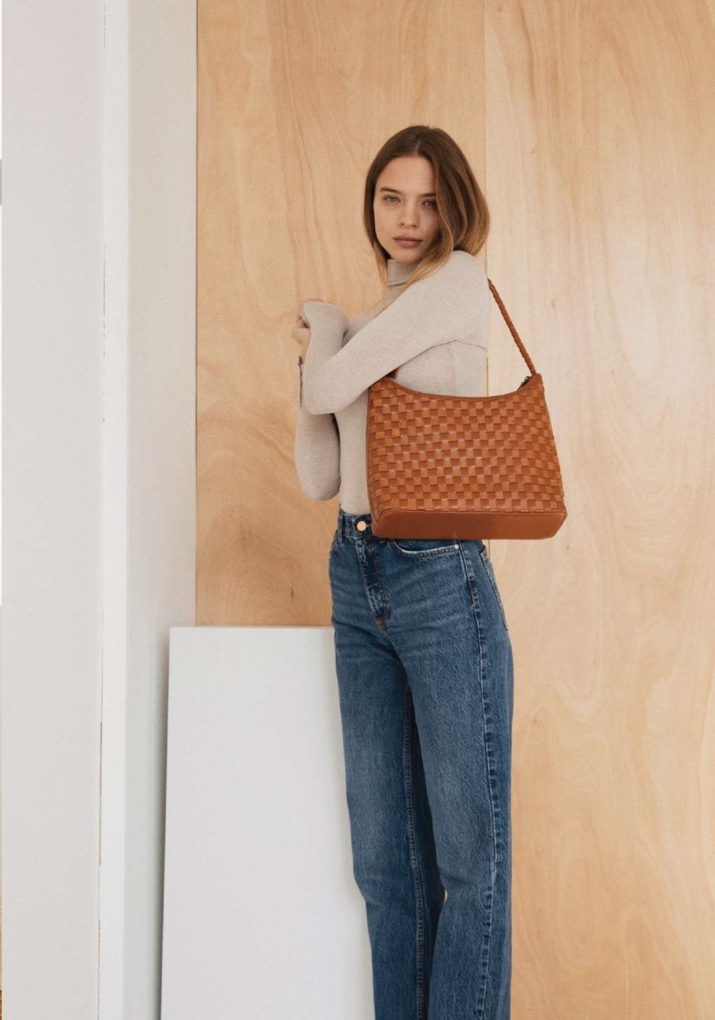
[MARNI BAG Large in Sienna x Copper Check]