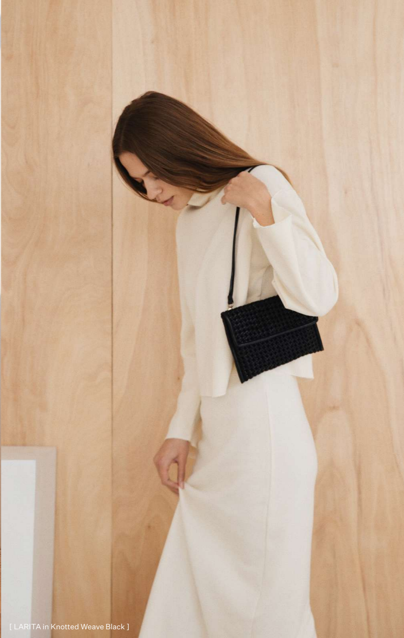
[ LARITA in Knotted Weave Black ]