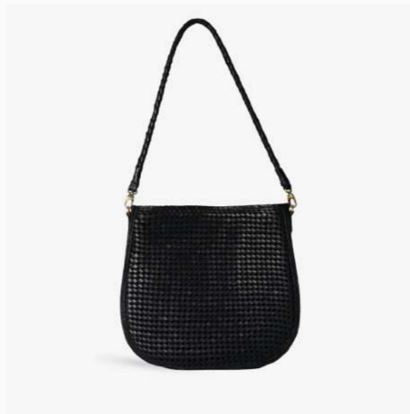
ALBA in Black