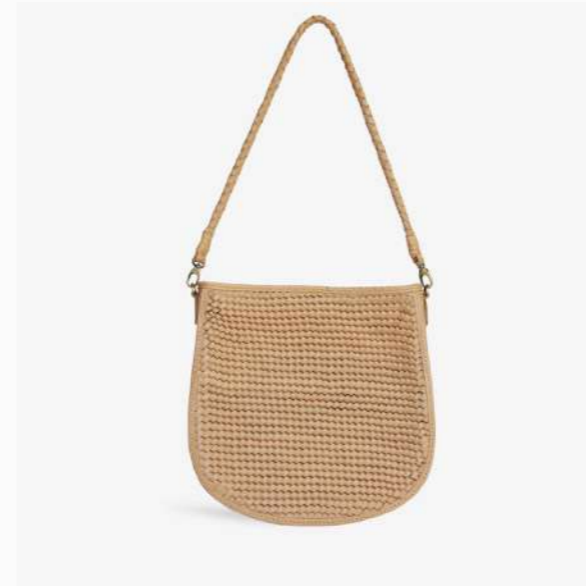
ALBA in Caramel