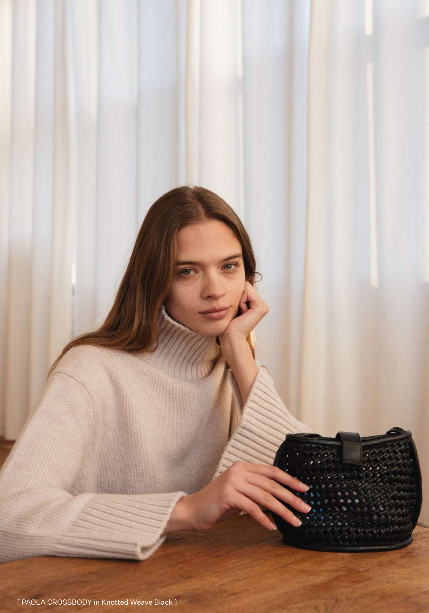
[ PAOLA CROSSBODY in Knotted Weave Black ]