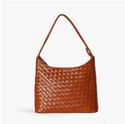
MARNI BAG Large in Sienna