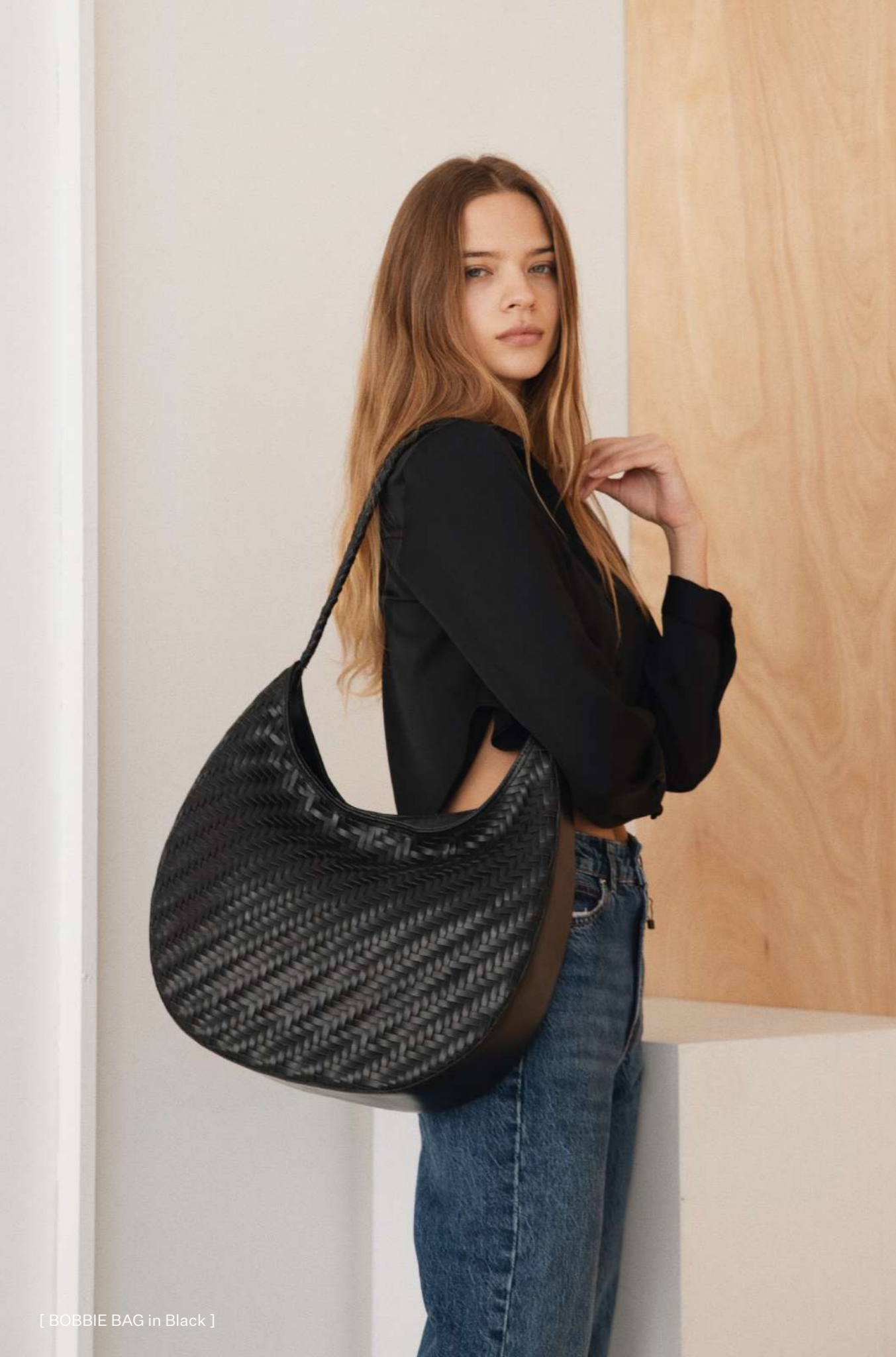
[ BOBBIE BAG in Black ]