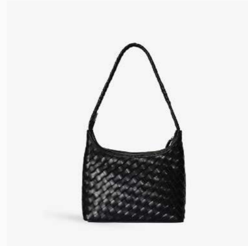
MARNI BAG Small in Black