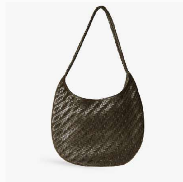
BOBBIE BAG in Olive