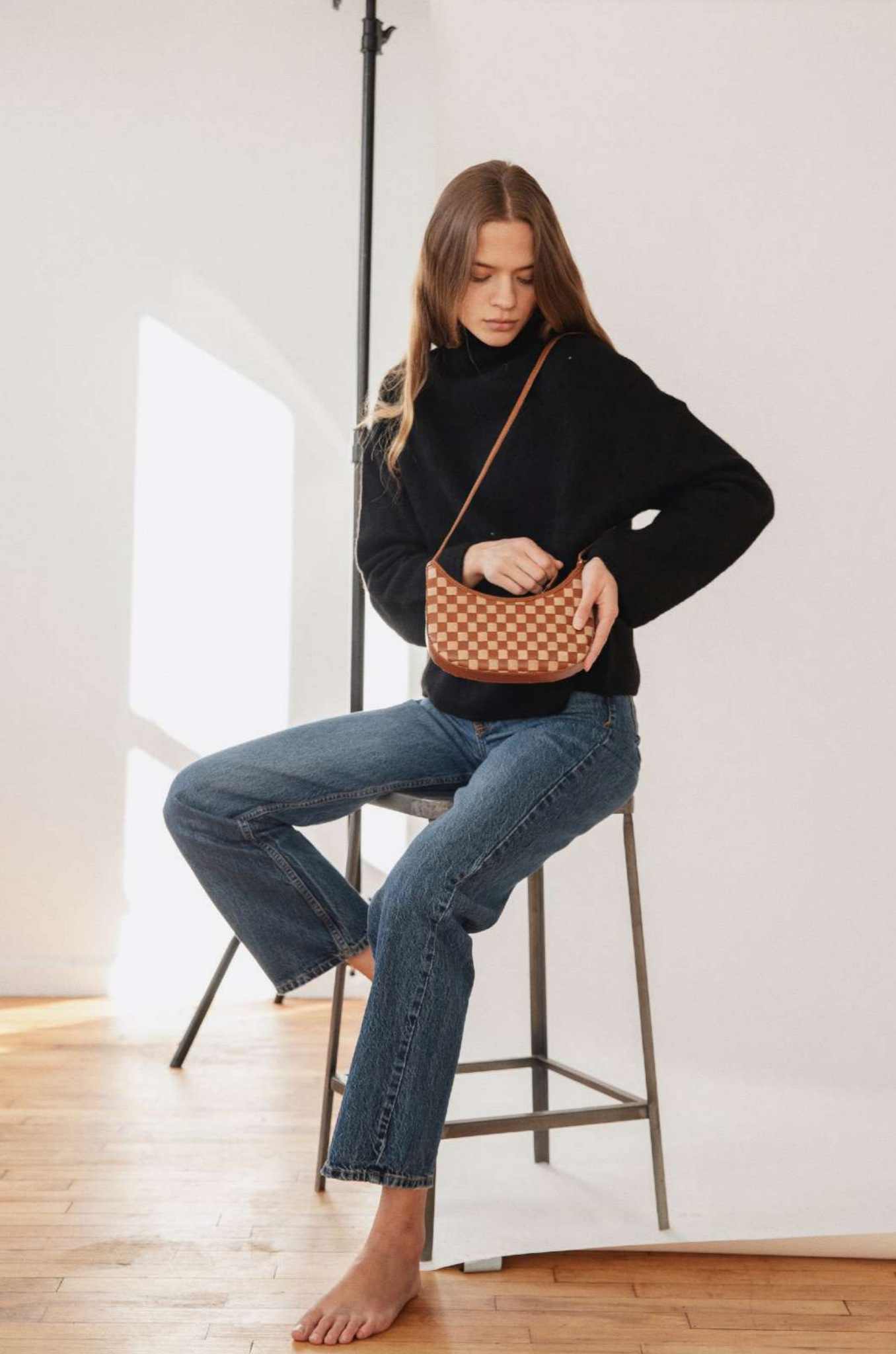
[ MINI SLING in Caramel x Sienna Check ]