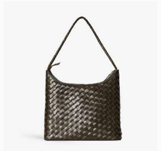
MARNI BAG Large in Olive