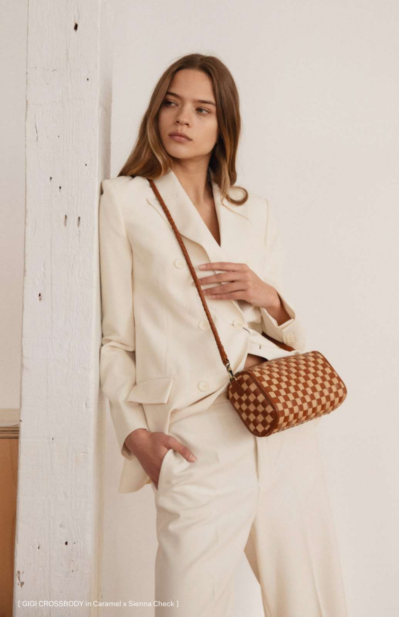
[ GIGI CROSSBODY in Caramel x Sienna Check ]