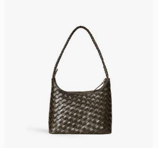
MARNI BAG Small in Olive