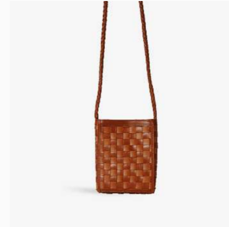
PORTA CROSSBODY in Sienna x Copper Check