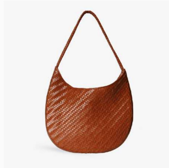
BOBBIE BAG in Sienna