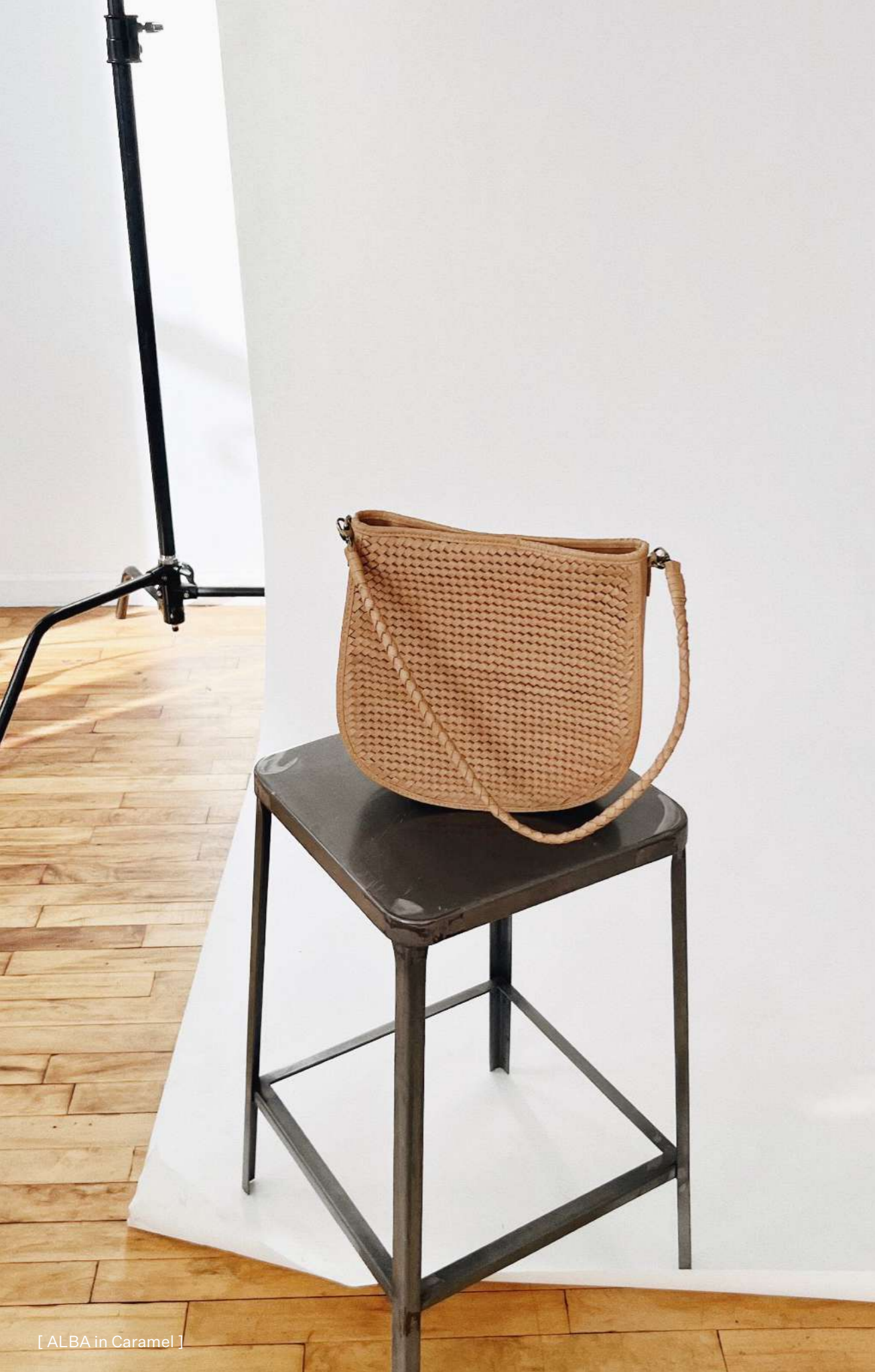
[ ALBA in Caramel ]