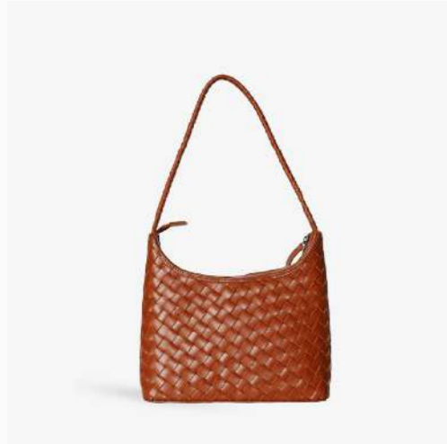
MARNI BAG Small in Sienna