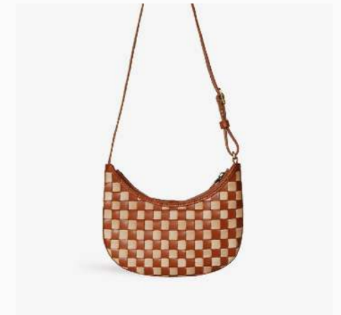
MINI SLING in Caramel x Sienna Check