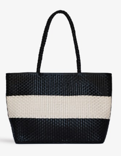
LUCIE in Black