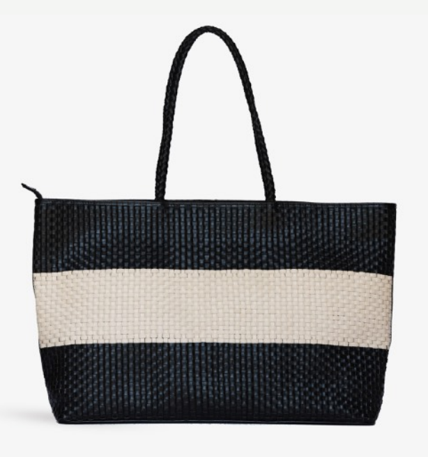
LE WEEKENDER in Black