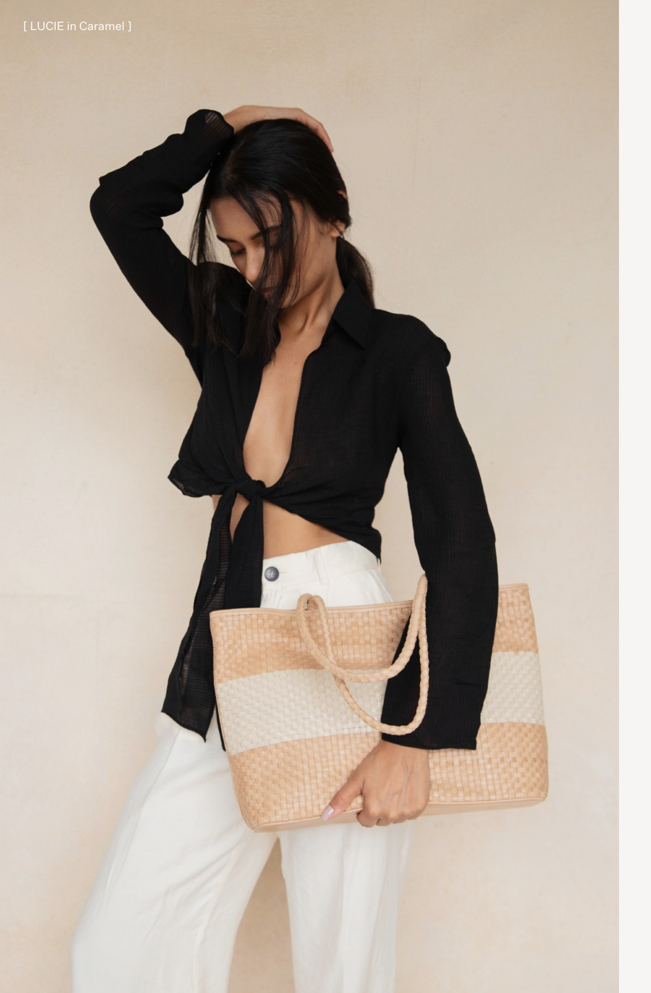
LUCIE An every-day carryall for your holiday travels.