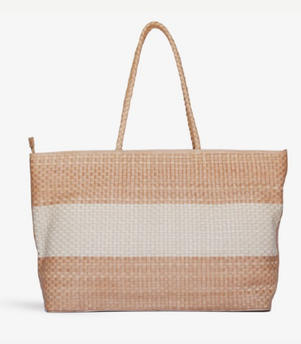
LE WEEKENDER in Caramel