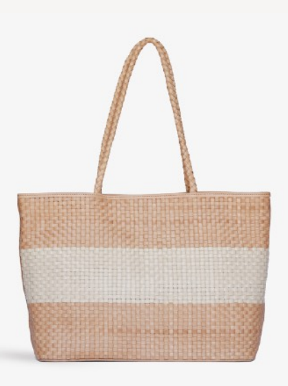
LUCIE in Caramel