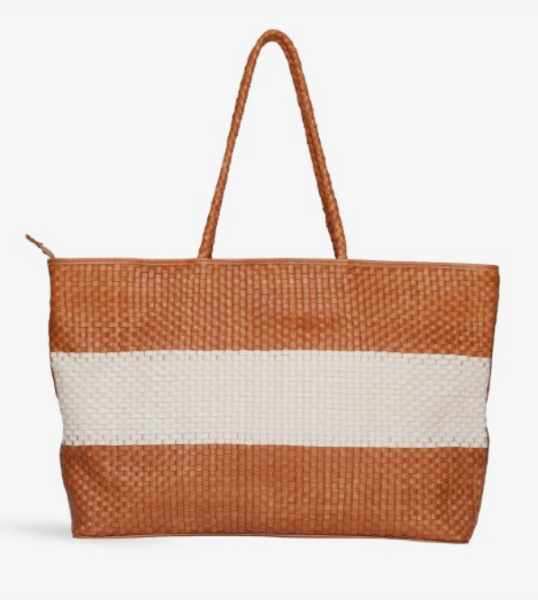
LE WEEKENDER in Copper