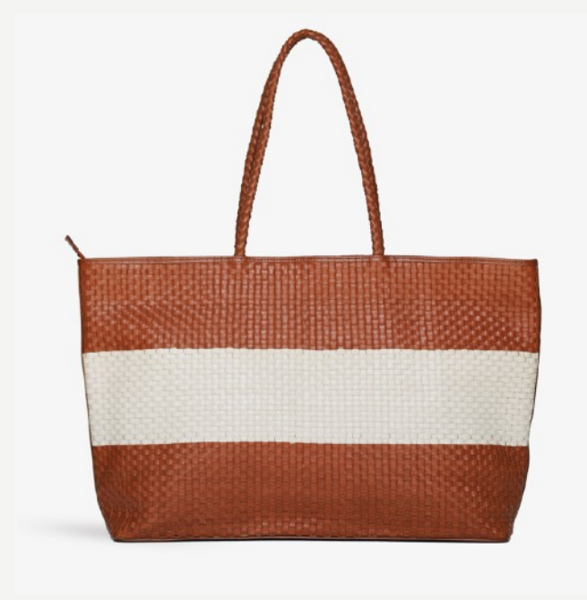
LE WEEKENDER in Sienna