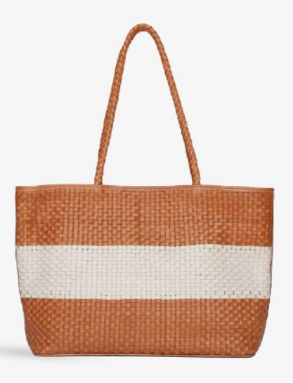
LUCIE in Copper