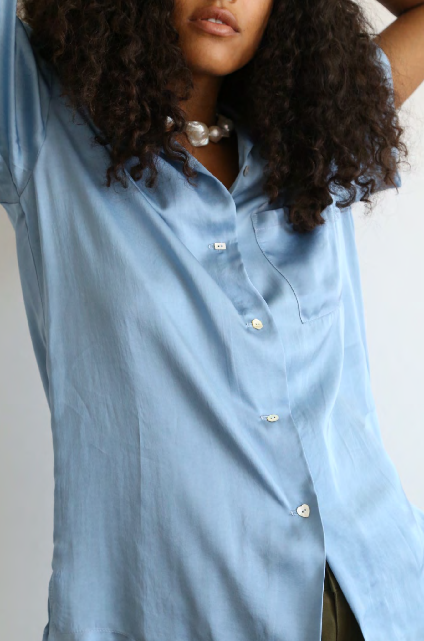
mother of pearl buttons: shapes