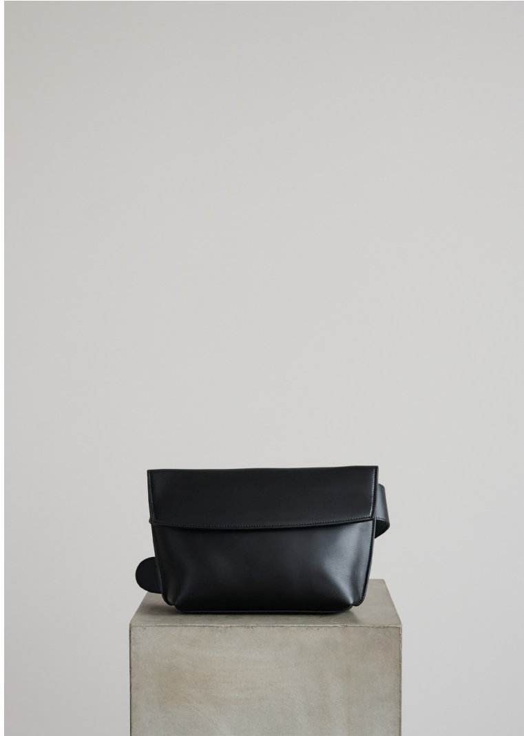
COLOR / MATERIAL SWATCH - VITELLO BLACK