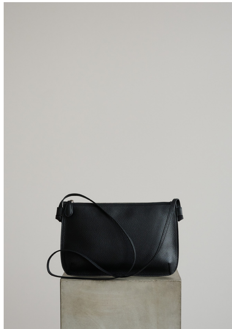
LARGE PURSE - VITELLO CHOCOLATE (SEE COLOR / MATERIAL SWATCH ON NEXT PAGE)

EUR WS: 171 / EUR RRP: 430 USD WS (ex factory): 183 / USD WS (landed): 219 / USD RRP: 460