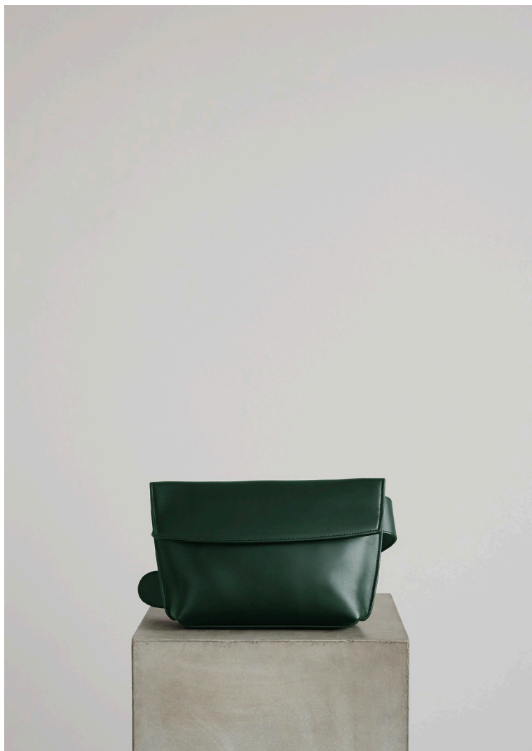
LARGE YARI - VITELLO BOSCO

EUR WS: 224 / EUR RRP: 560 USD WS (ex factory): 240 / USD WS (landed): 288 / USD RRP: 600