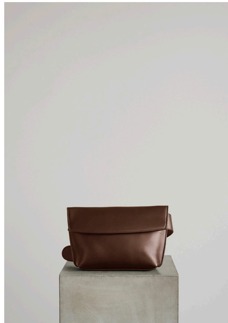
LARGE YARI - VITELLO CHOCOLATE

EUR WS: 224 / EUR RRP: 560 USD WS (ex factory): 240 / USD WS (landed): 288 / USD RRP: 600