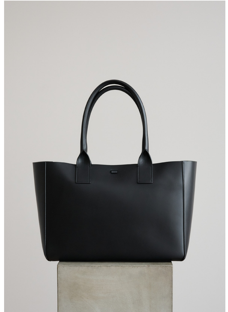
FILIPPO WORK BAG - VITELLO BLACK

EUR WS: 331 / EUR RRP: 830 USD WS (ex factory): 354 / USD WS (landed): 425 / USD RRP: 890