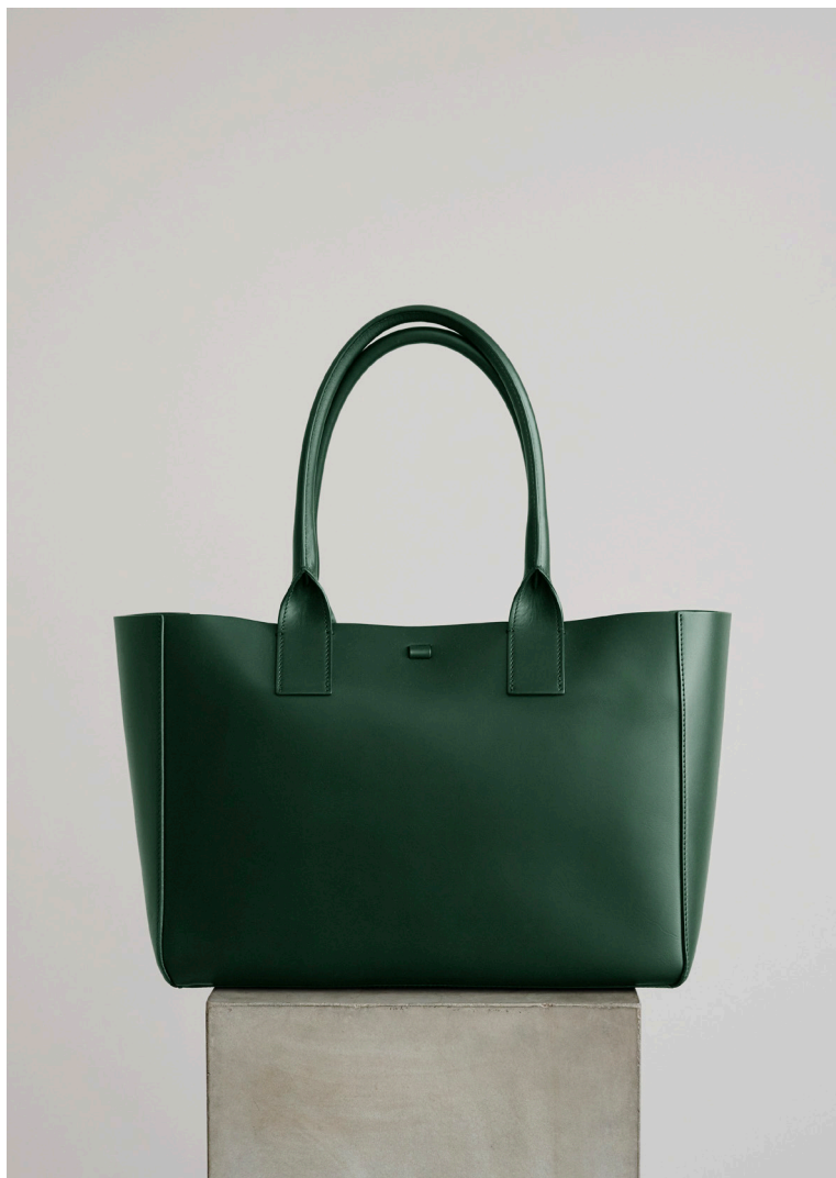
FILIPPO WORK BAG - VITELLO BOSCO

EUR WS: 331 / EUR RRP: 830 USD WS (ex factory): 354 / USD WS (landed): 425 / USD RRP: 890