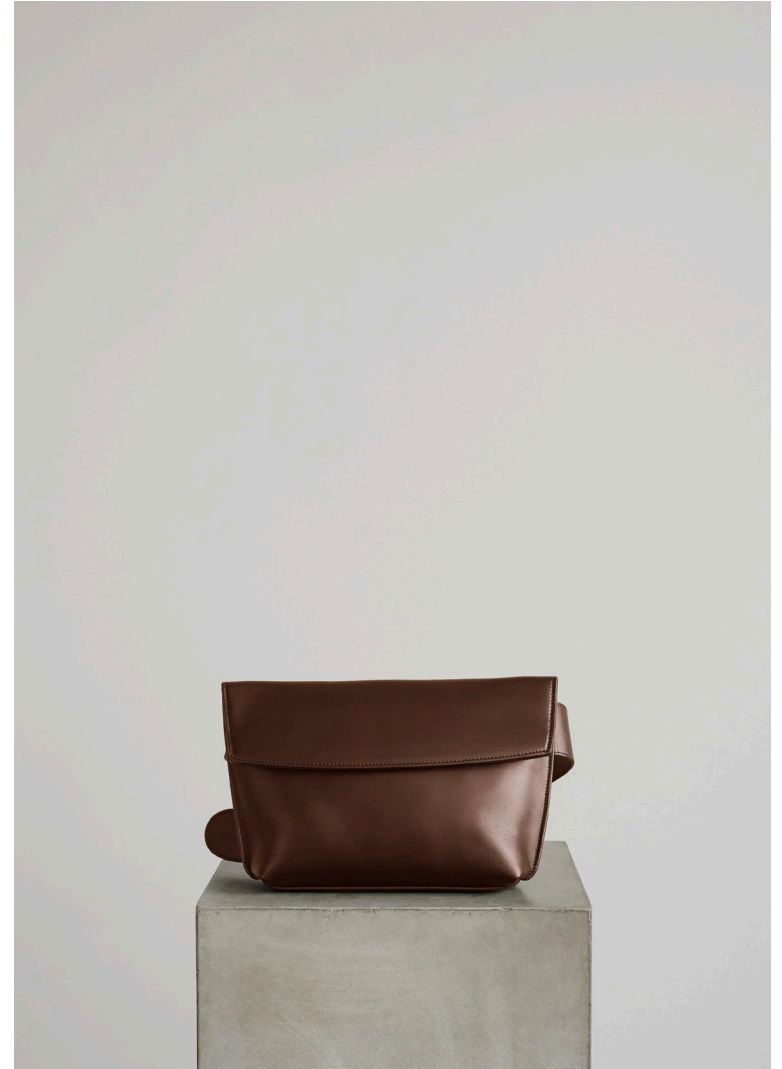
COLOR / MATERIAL SWATCH - VITELLO CHOCOLATE