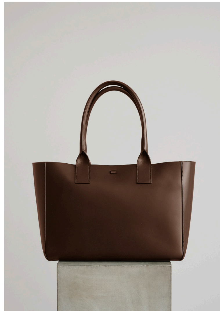
FILIPPO WORK BAG - VITELLO CHOCOLATE

EUR WS: 331 / EUR RRP: 830 USD WS (ex factory): 354 / USD WS (landed): 425 / USD RRP: 890