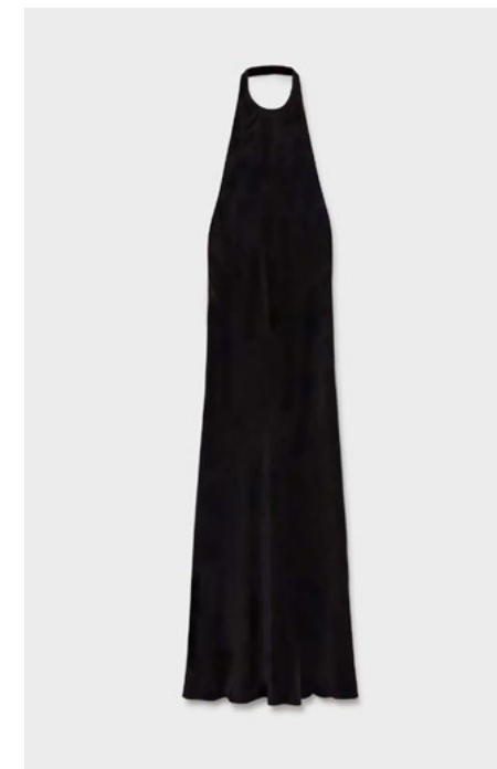
Halter Dress 100% Silk. Available in Black.