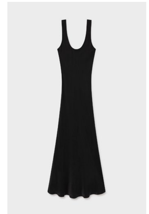
Scoop Neck Dress 100% Silk. Available in Black and Midnight.