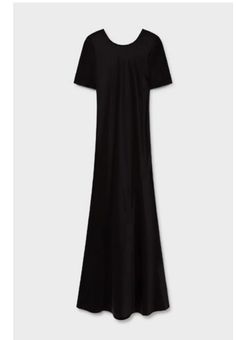
Short Sleeve Bias Dress 100% Silk. Available in Black.