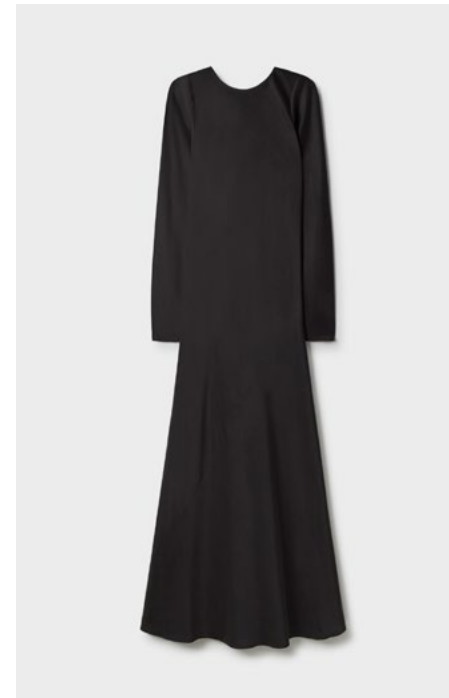
Full Sleeve Bias Dress 100% Silk. Available in Black.

Iconic styles for the refined woman, our Silk Dresses are designed to highlight one's natural figure, the slip was created with the purpose of rewriting fashion's principles by envisioning a piece that is effortless and long-lasting.