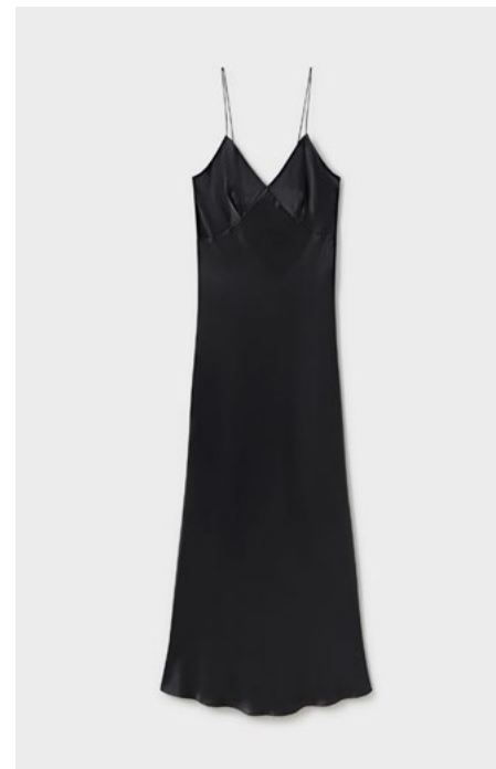
Deco Rouleau Dress 100% Silk. Available in Moon, Black and Midnight.