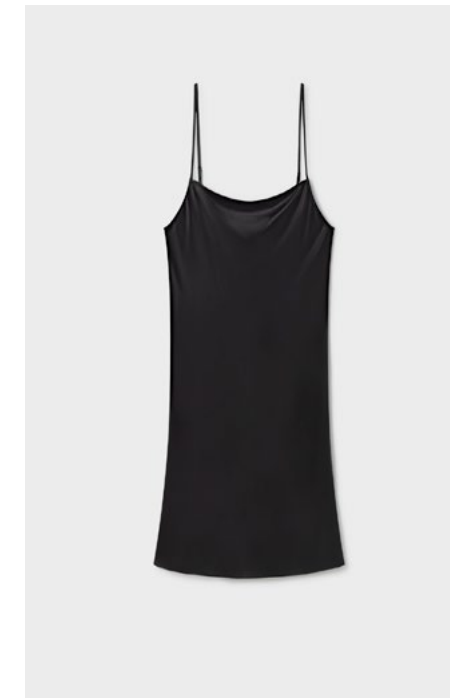
Straight Neck Dress 100% Silk. Available in Black.