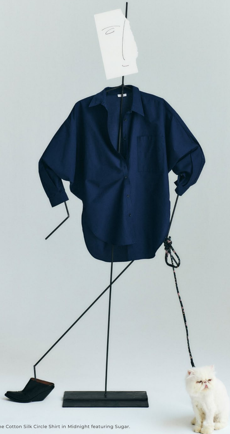
(still life) The Cotton Silk Circle Shirt in Midnight featuring Sugar.