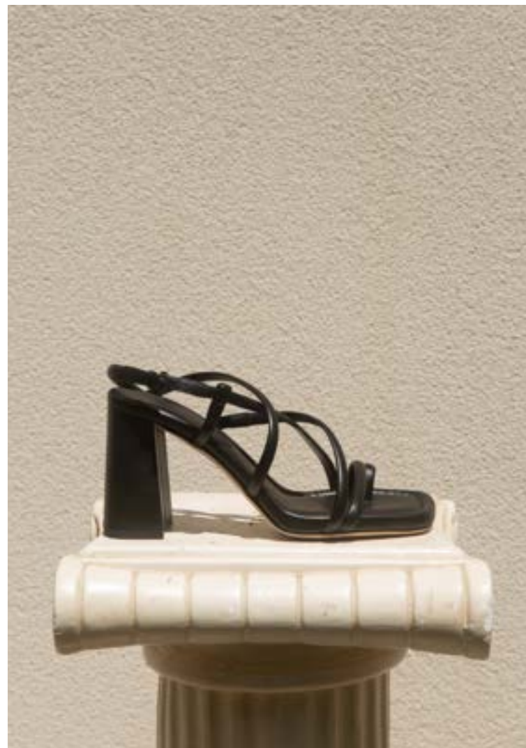
BENEDETTA SANDAL BLACK WHS: 204 € / RRP: 510 €