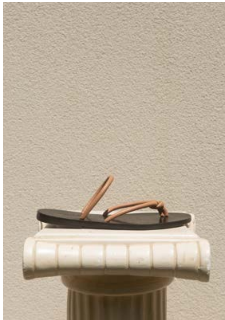
ANNA SANDAL ROSY WHS: 130 € / RRP: 325 €