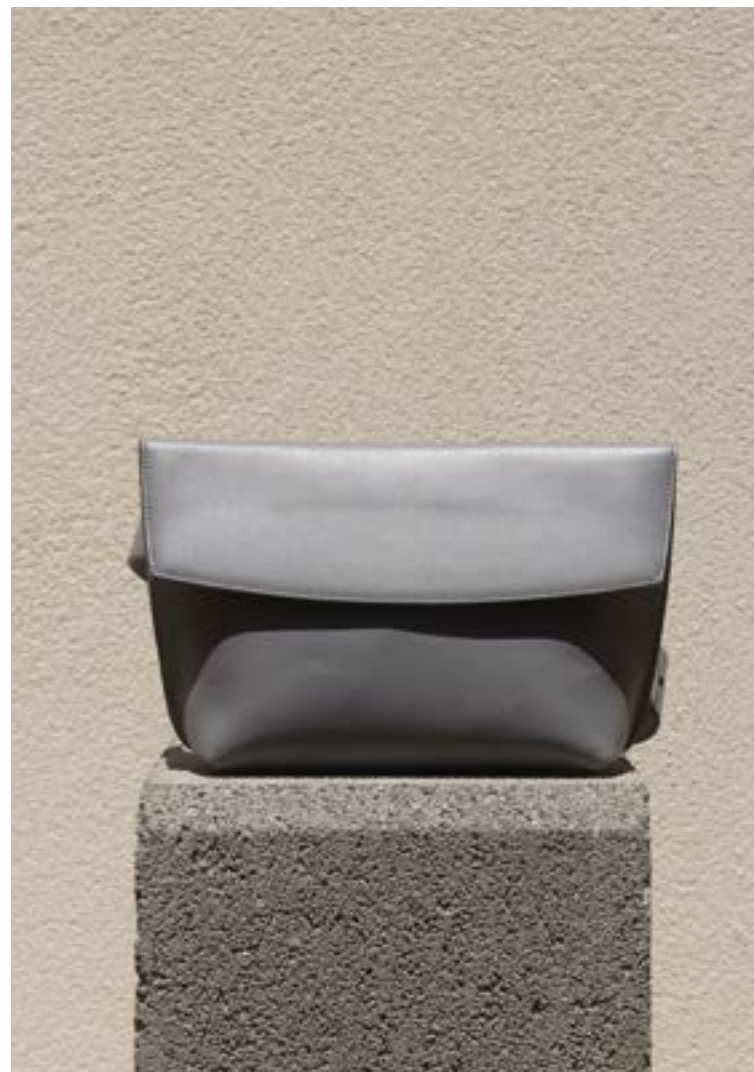
LARGE YARI VITELLO SKY WHS: 248 € / RRP: 620 €