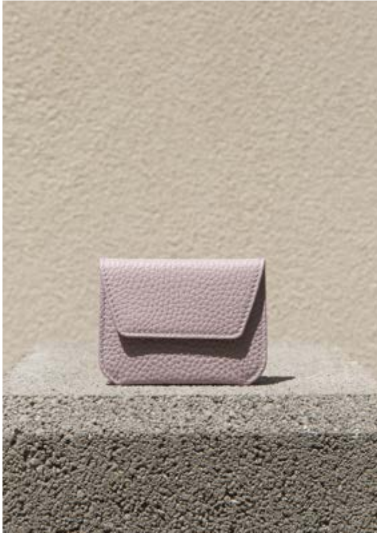
MINI HASSE PURSE RIO LAVENDER WHS: 86 € / RRP: 215 €