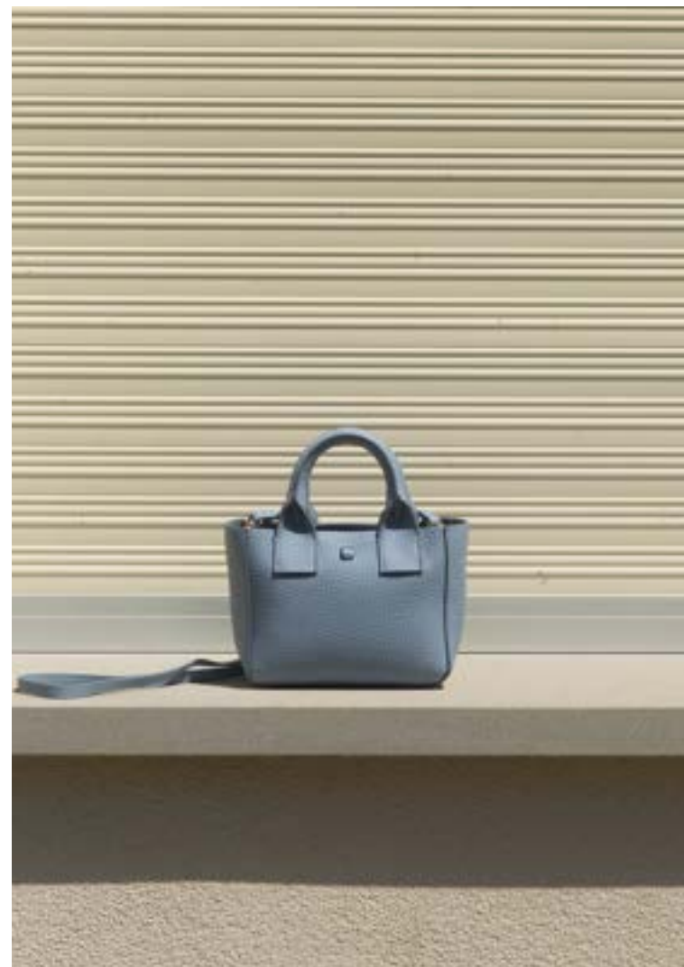
MINI FILIPPO BAG RIO SAVOIA WHS: 226 € / RRP: 565 €