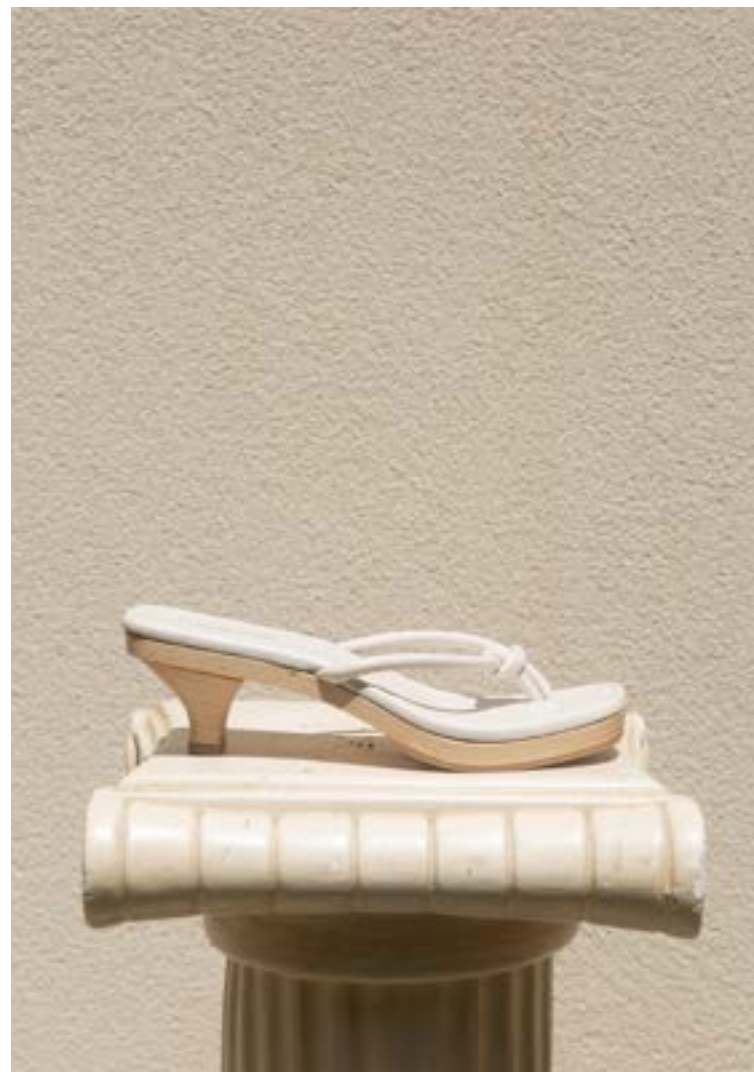
GIANA SANDAL LATTE WHS: 150 € / RRP: 375 €