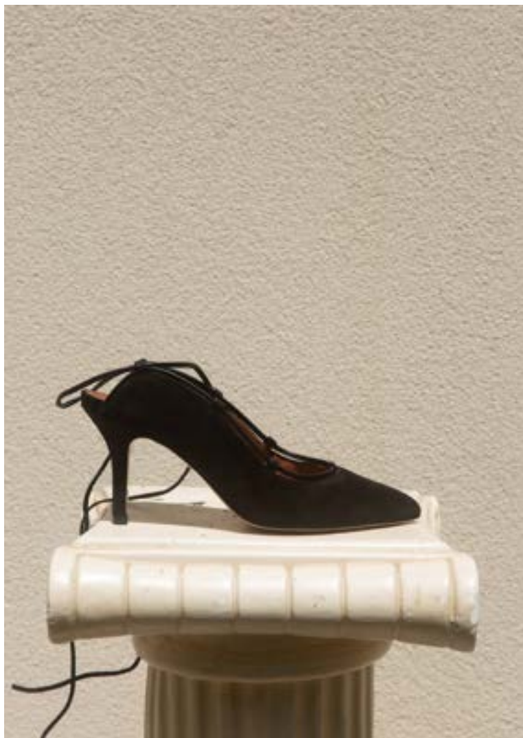
CHETY PUMP BLACK SUEDE WHS: 204 € / RRP: 510 €