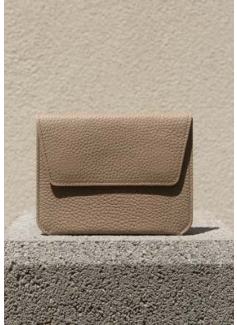
HASSE PURSE RIO STONE WHS: 118 € / RRP: 295 €