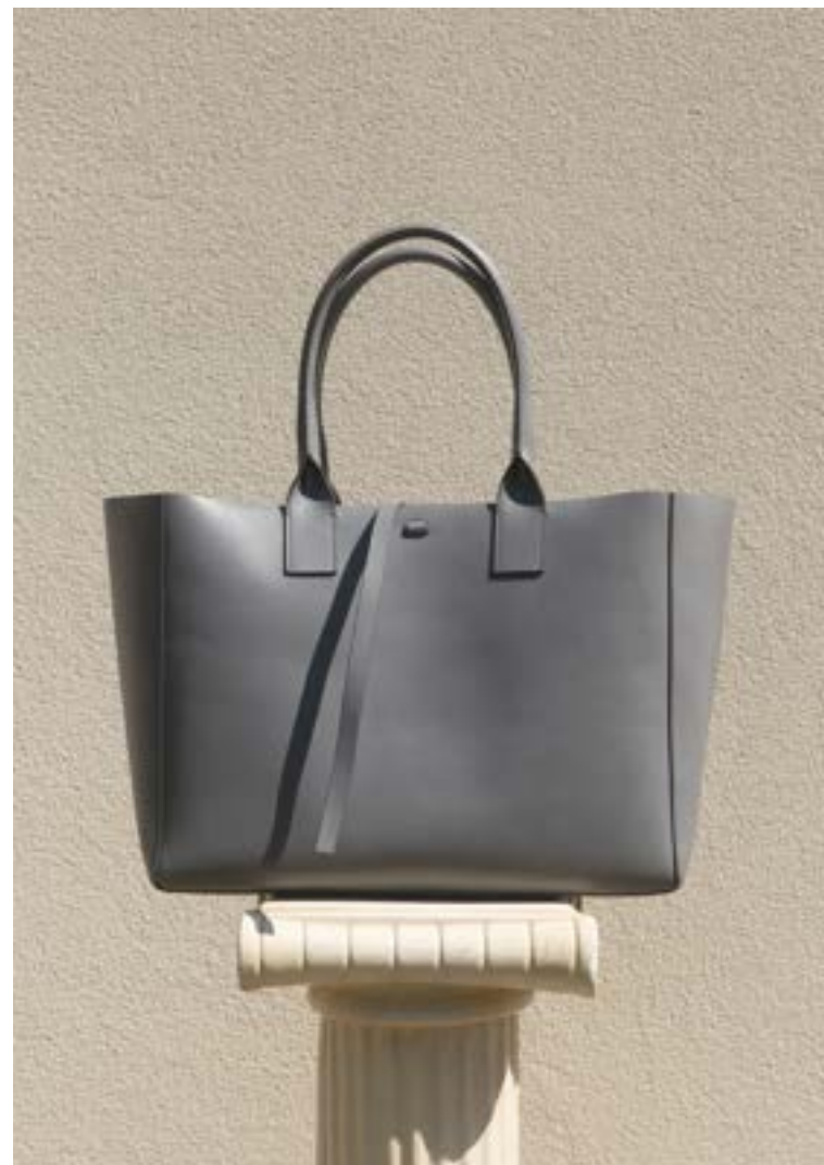
LARGE FILIPPO BAG VITELLO SKY WHS: 420 € / RRP: 1050 €