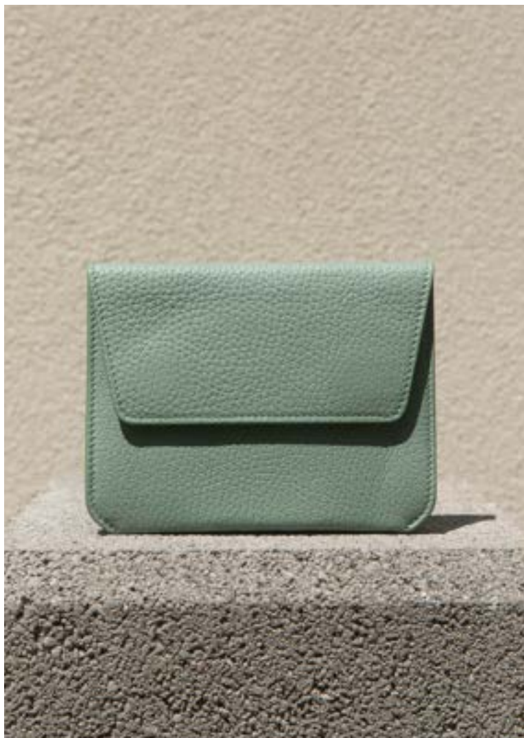
HASSE PURSE RIO MINTY WHS: 118 € / RRP: 295 €