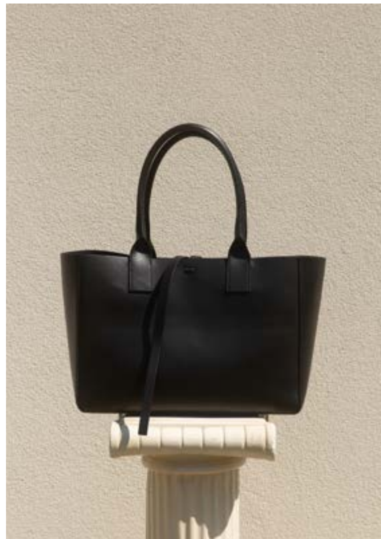
FILIPPO WORK BAG VITELLO BLACK WHS: 366 € / RRP: 915 €