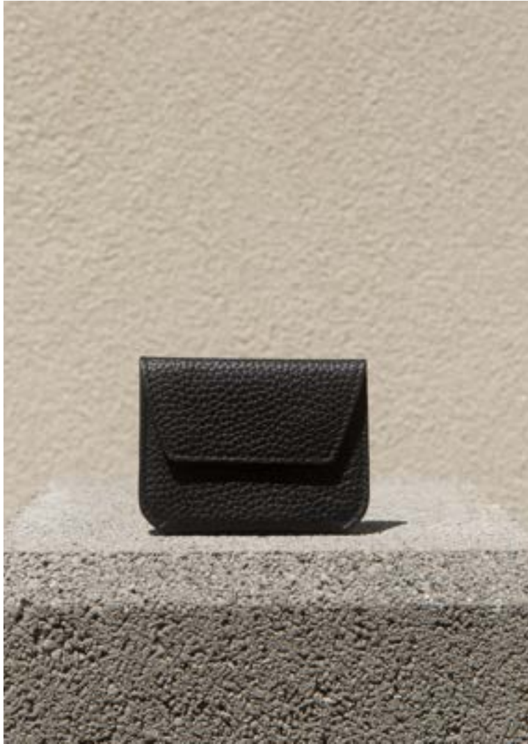
MINI HASSE PURSE RIO BLACK WHS: 86 € / RRP: 215 €