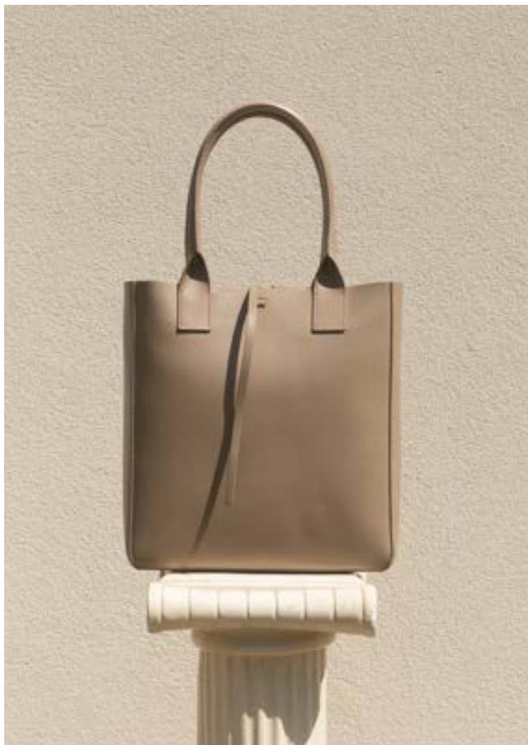
FILIPPO BAG VITELLO STONE WHS: 334 € / RRP: 835 €