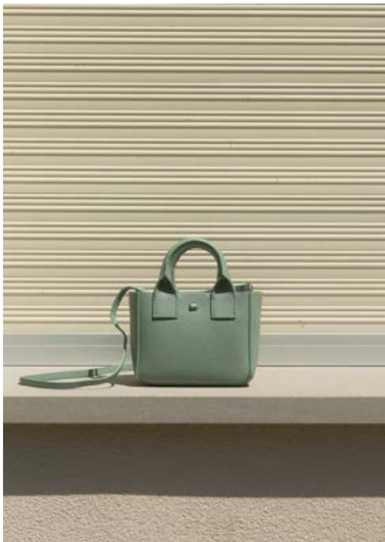
MINI FILIPPO BAG RIO MINTY WHS: 226 € / RRP: 565 €