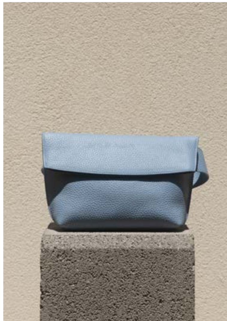
LARGE YARI RIO SAVOIA WHS: 225 € / RRP: 565 €