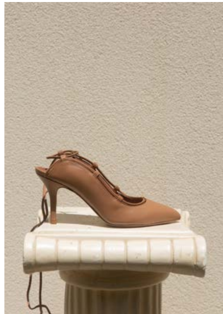
CHETY PUMP ROSY WHS: 204 € / RRP: 510 €