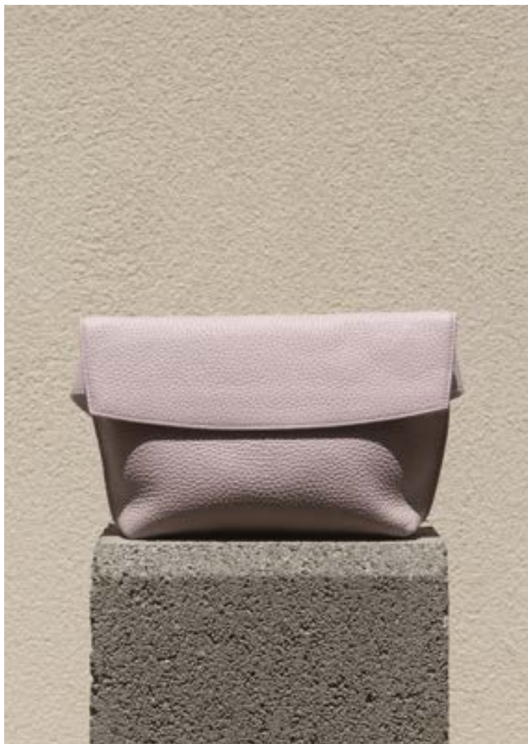
LARGE YARI RIO LAVENDER WHS: 225 € / RRP: 565 €