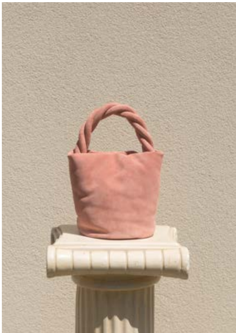
JOHANNA MINI BUCKET SUEDE CONFETTO VHS: 206 € / RRP: 515 €