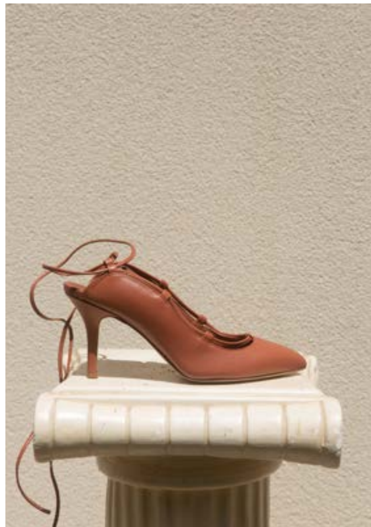
CHETY PUMP TERRACOTTA WHS: 204 € / RRP: 510 €