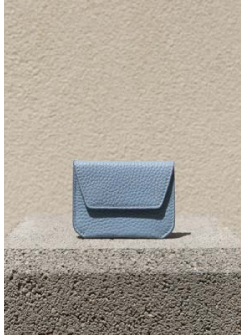
MINI HASSE PURSE RIO SAVOIA WHS: 86 € / RRP: 215 €