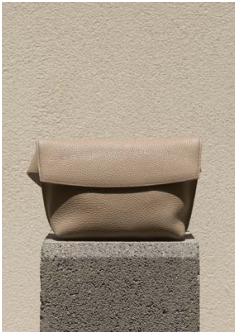
LARGE YARI RIO STONE WHS: 225 € / RRP: 565 €