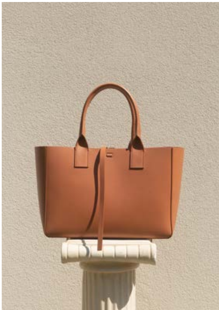
FILIPPO WORK BAG VITELLO APRICOT WHS: 366 € / RRP: 915 €