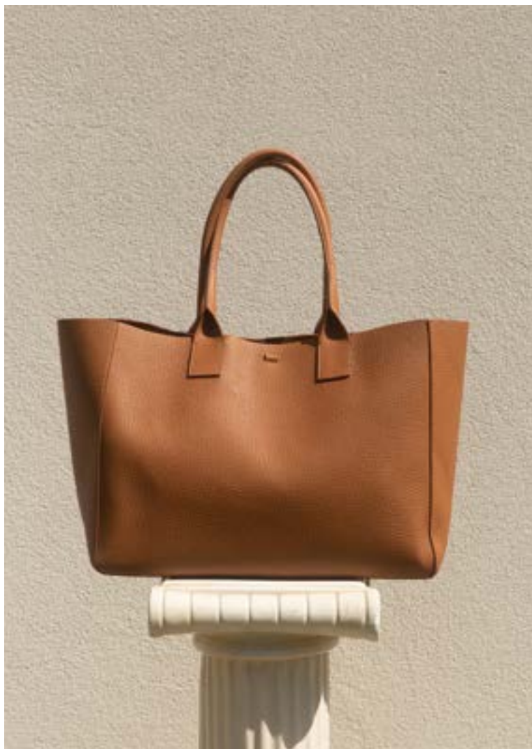
LARGE FILIPPO BAG RIO AMBRA WHS: 388 € / RRP: 970 €