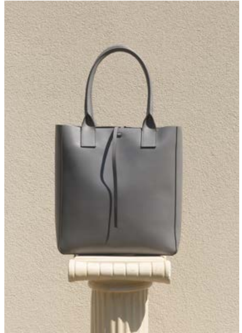
FILIPPO BAG VITELLO SKY WHS: 334 € / RRP: 835 €