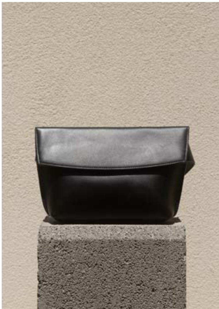
LARGE YARI VITELLO BLACK WHS: 248 € / RRP: 620 €