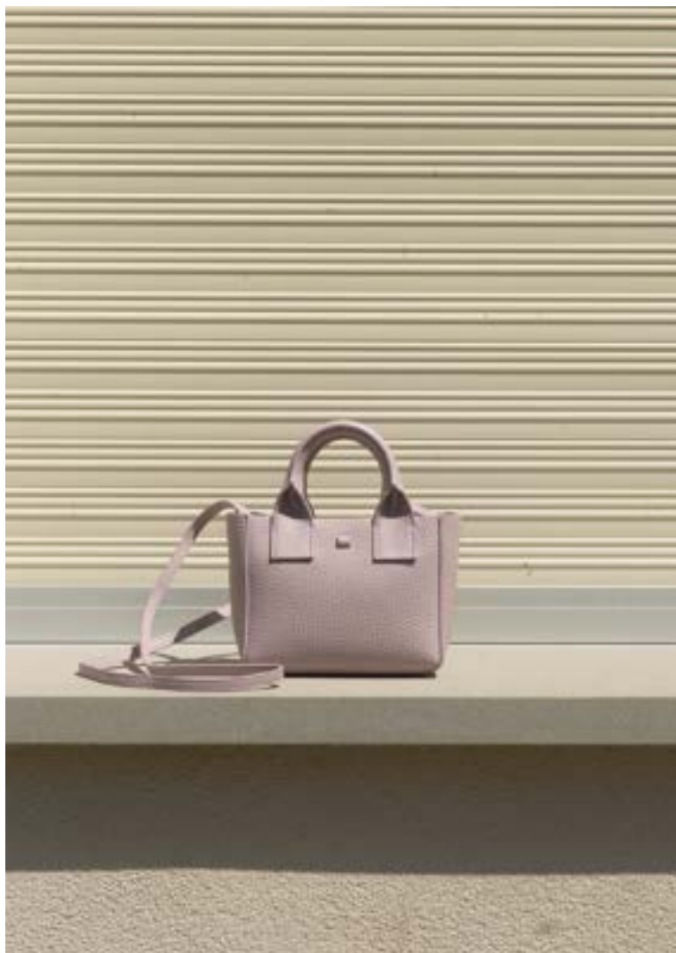
MINI FILIPPO BAG RIO LAVENDER WHS: 226 € / RRP: 565 €