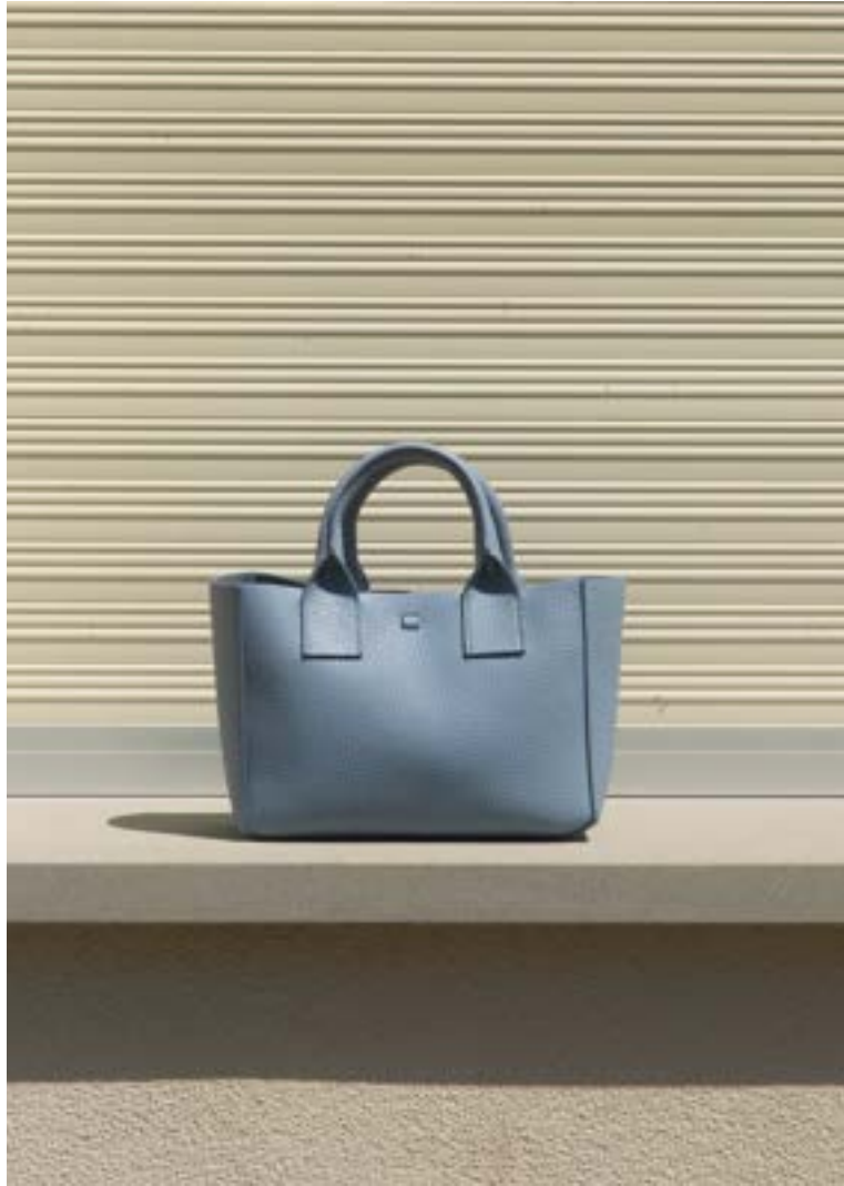
LITTLE FILIPPO BAG RIO SAVOIA WHS: 238 € / RRP: 595 €