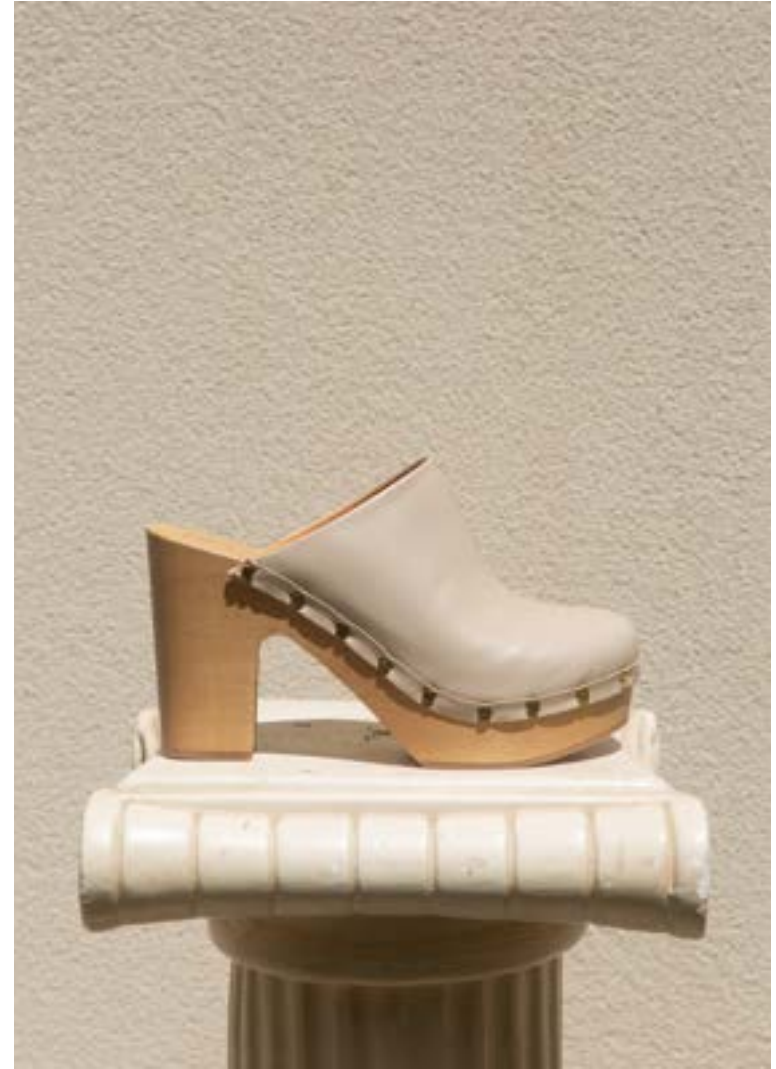
PERNILLE CLOG PUTTY WHS: 172 € / RRP: 430 €