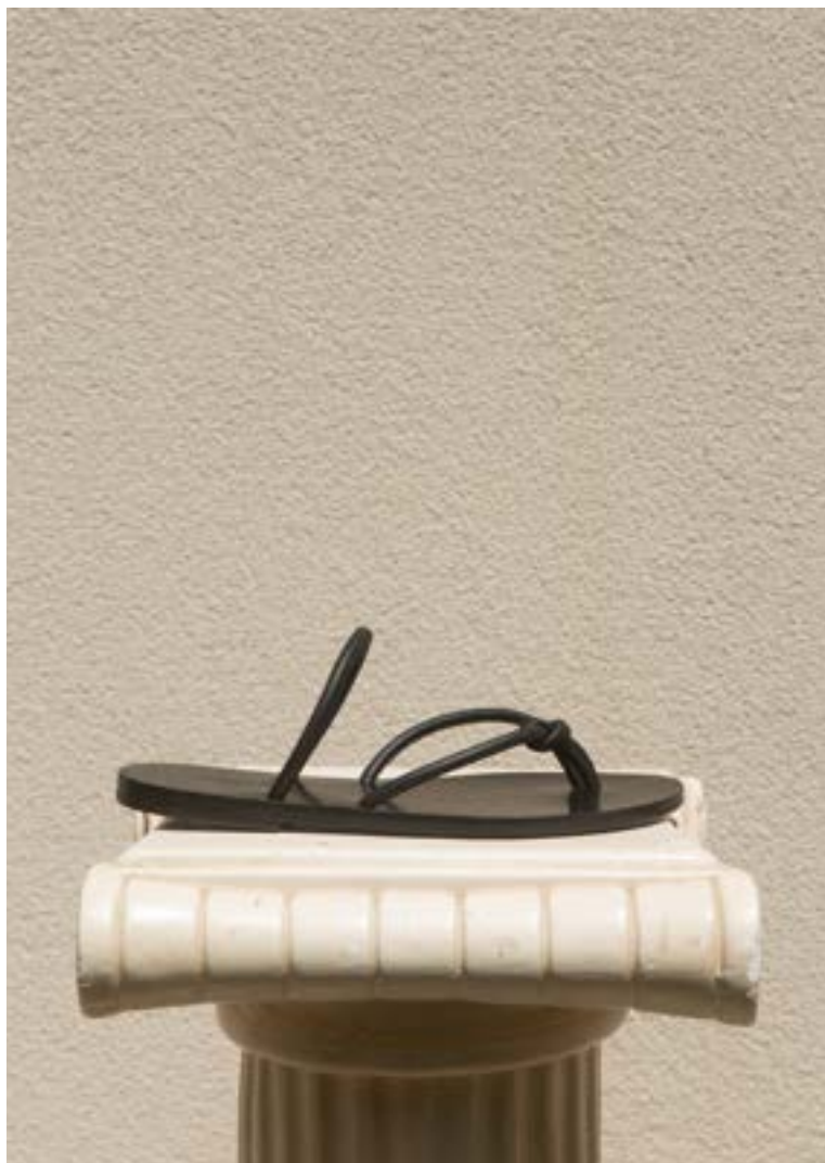
ANNA SANDAL BLACK WHS: 130 € / RRP: 325 €