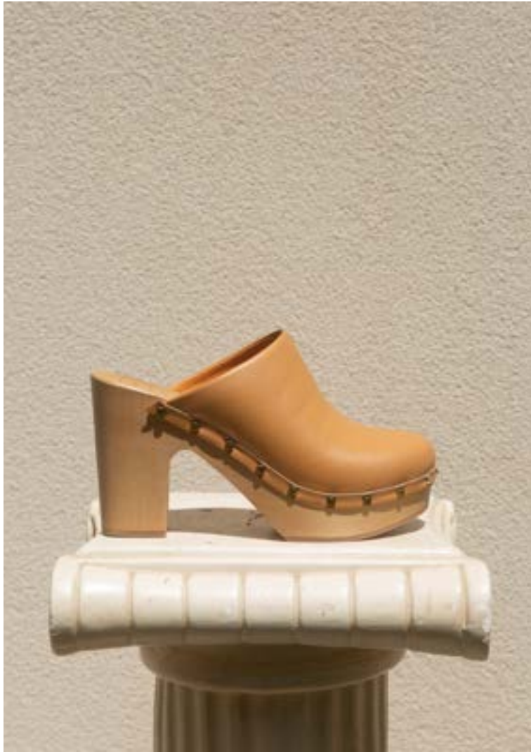
PERNILLE CLOG EATH WHS: 172 € / RRP: 430 €