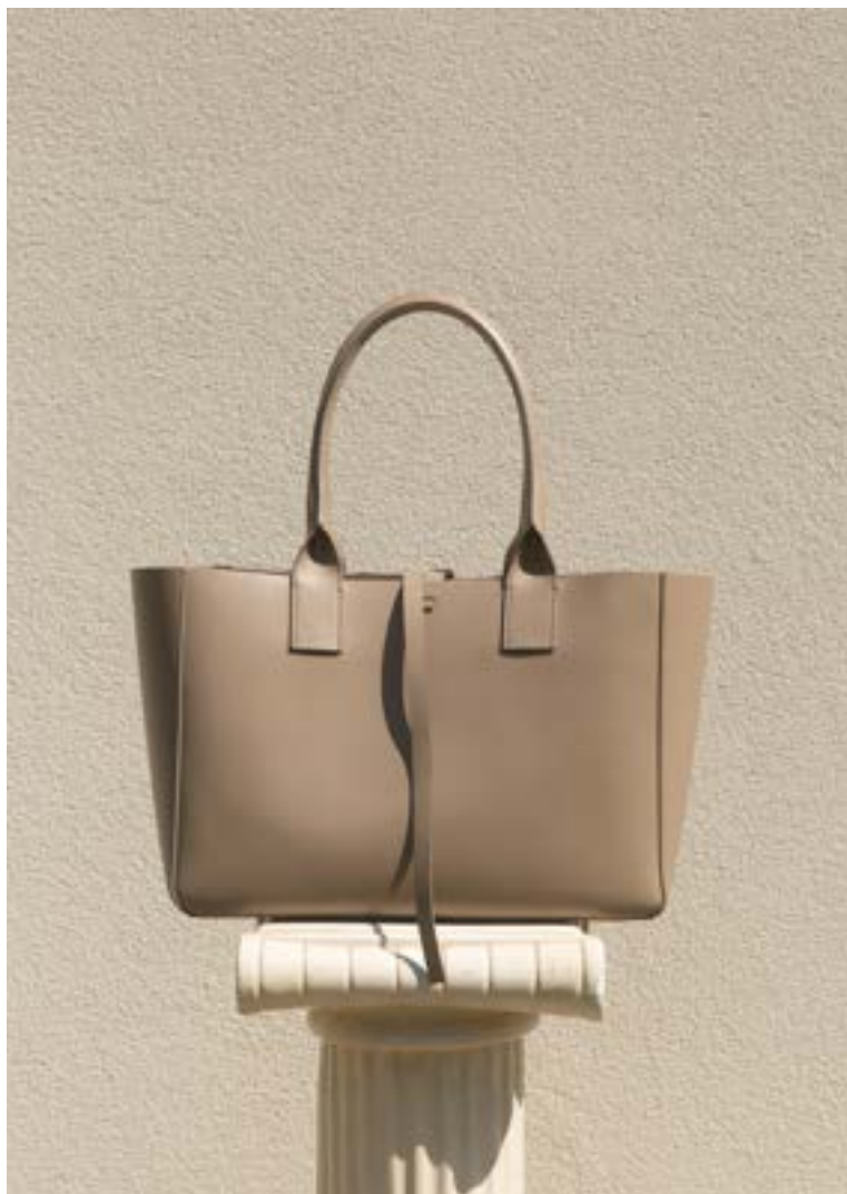
FILIPPO WORK BAG VITELLO STONE WHS: 366 € / RRP: 915 €