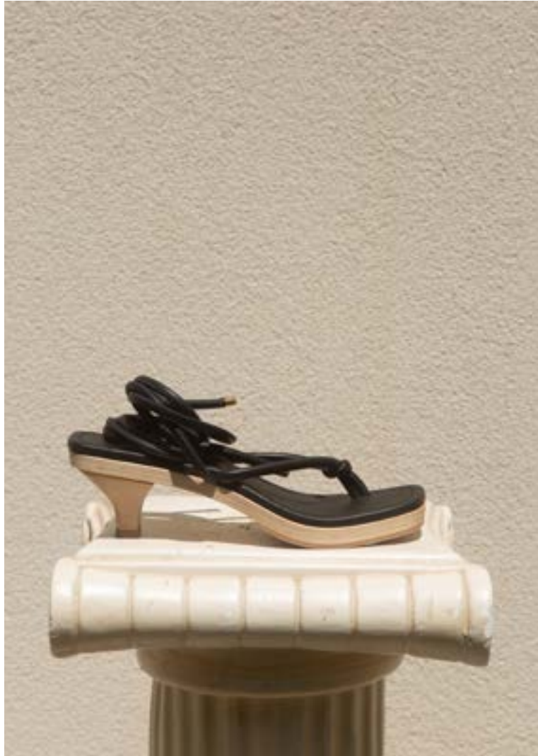
GIANA SANDAL STRAP BLACK WHS: 170 € / RRP: 430 €