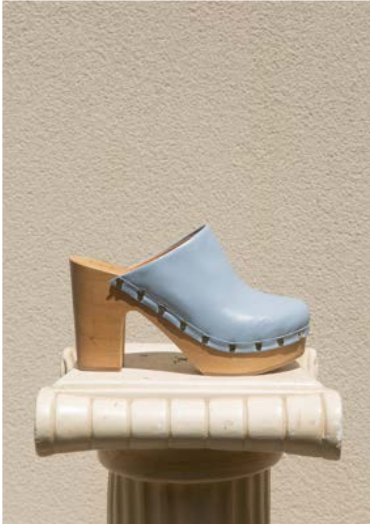
PERNILLE CLOG SAVOIA WHS: 172 € / RRP: 430 €