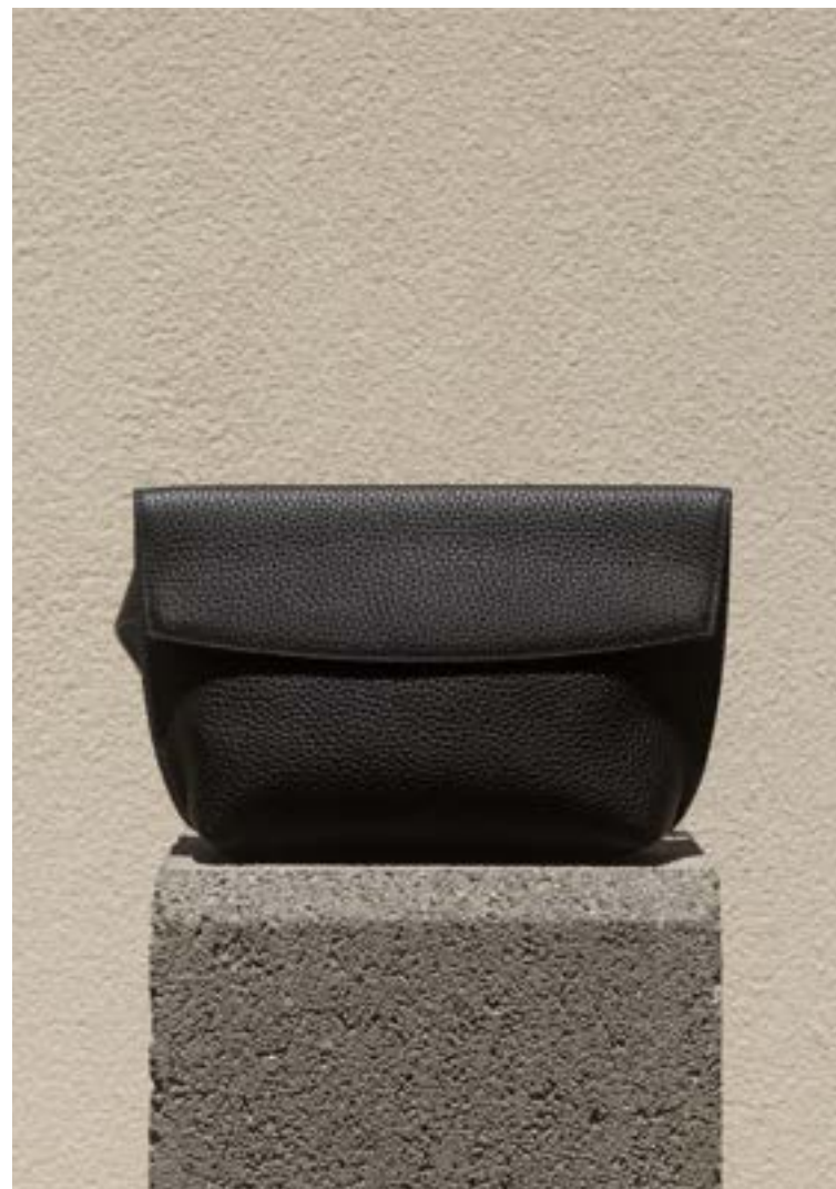
LARGE YARI RIO BLACK WHS: 225 € / RRP: 565 €