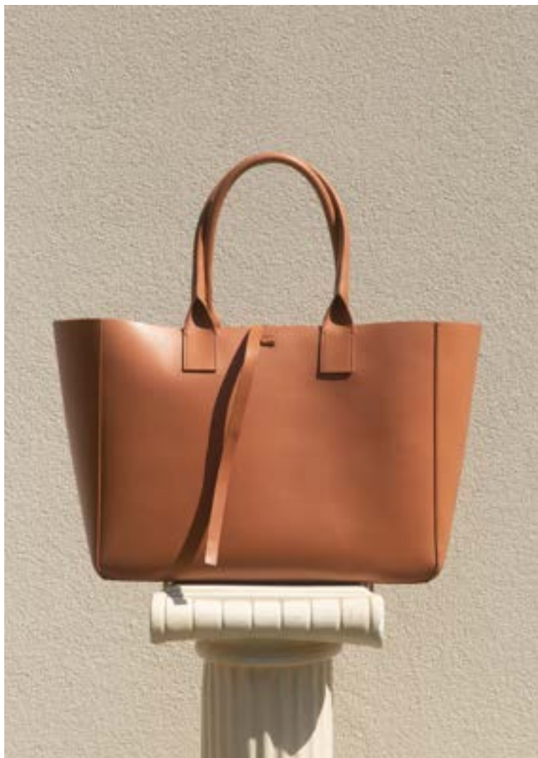
LARGE FILIPPO BAG VITELLO APRICOT WHS: 420 € / RRP: 1050 €