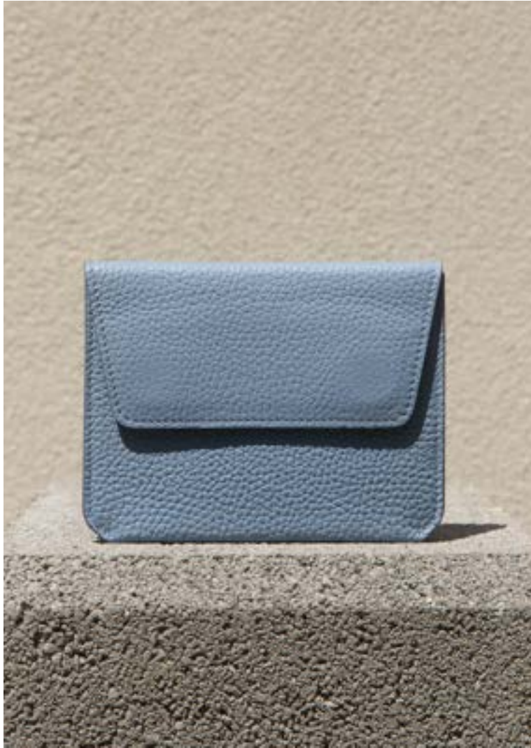
HASSE PURSE RIO SAVOIA WHS: 118 € / RRP: 295 €