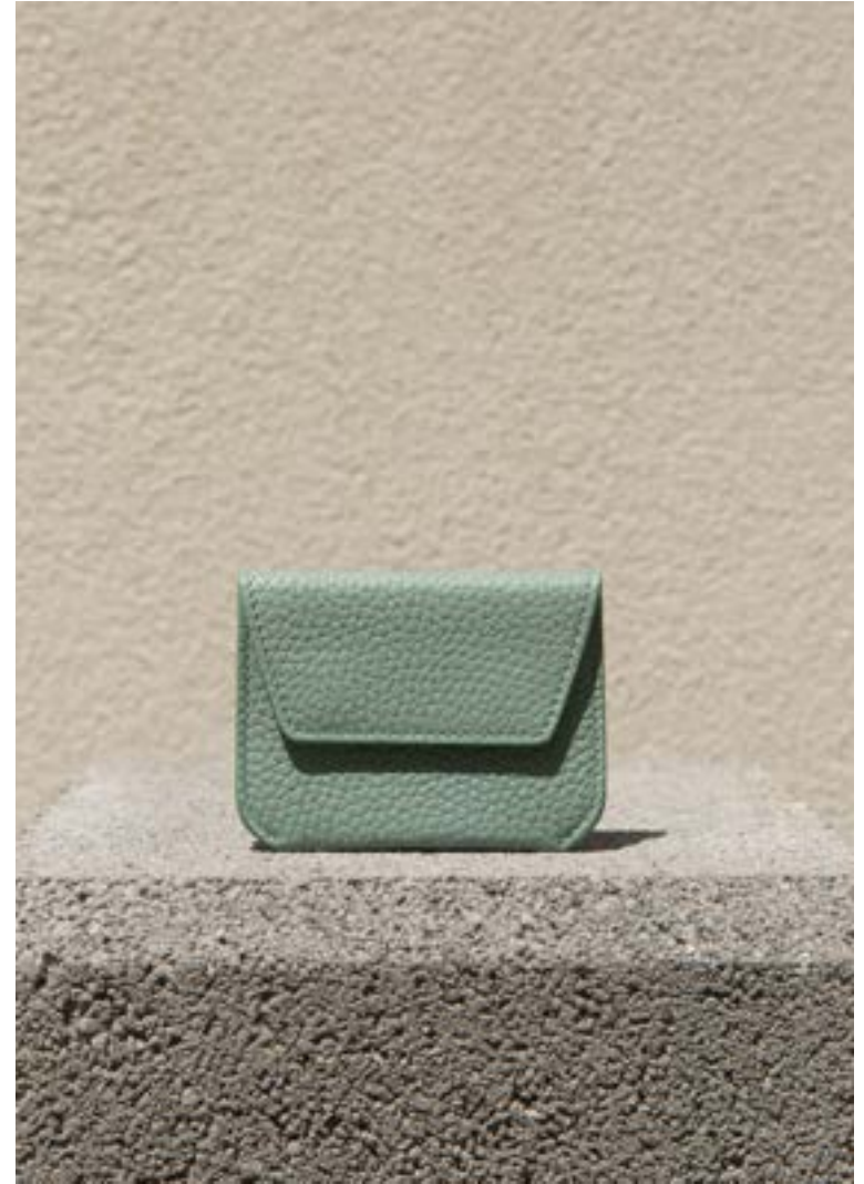
MINI HASSE PURSE RIO MINTY WHS: 86 € / RRP: 215 €