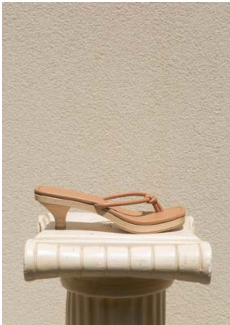
GIANA SANDAL ROSY WHS: 150 € / RRP: 375 €