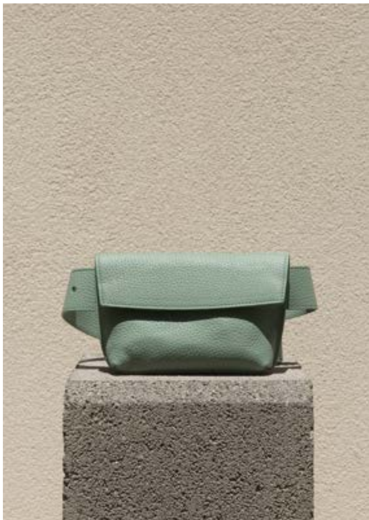
YARI RIO MINTY WHS: 184 € / RRP: 460 €