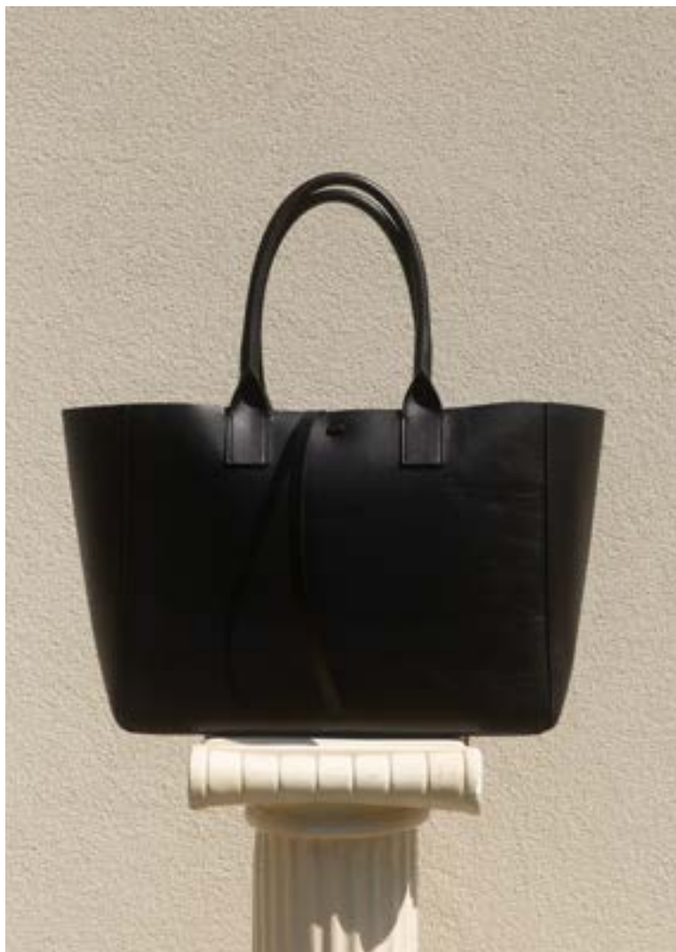
LARGE FILIPPO BAG VITELLO BLACK WHS: 420 € / RRP: 1050 €