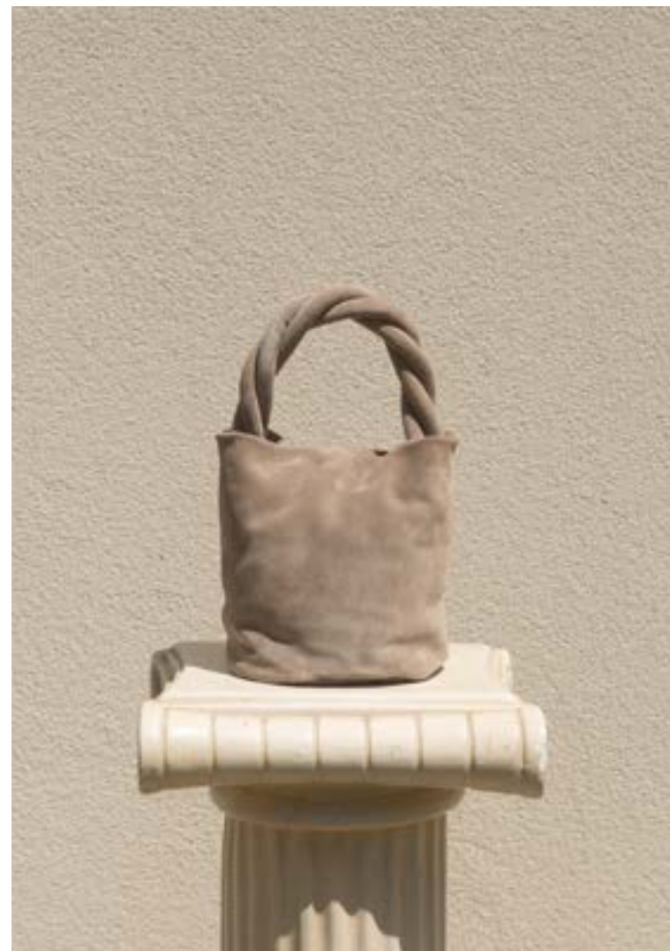
JOHANNA MINI BUCKET SUEDE STONE WHS: 206 € / RRP: 515 €