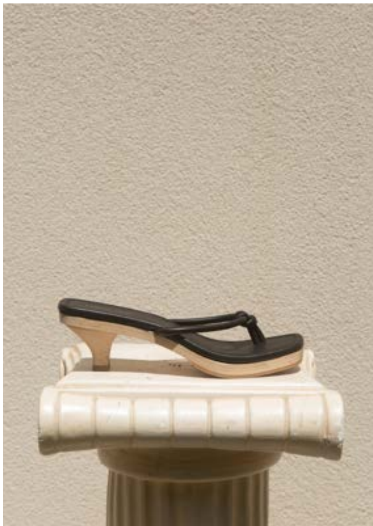
GIANA SANDAL BLACK WHS: 150 € / RRP: 375 €