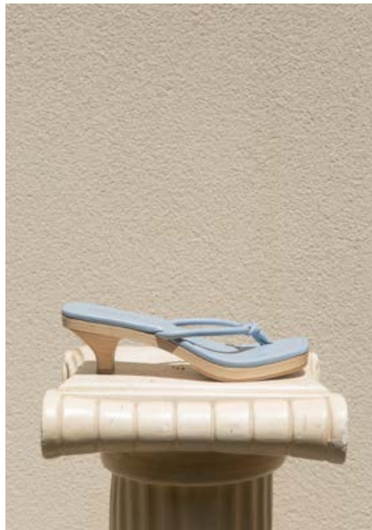
GIANA SANDAL SAVOIA WHS: 150 € / RRP: 375 €