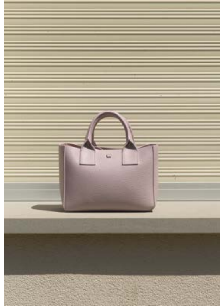
LITTLE FILIPPO BAG RIO LAVENDER WHS: 238 € / RRP: 595 €