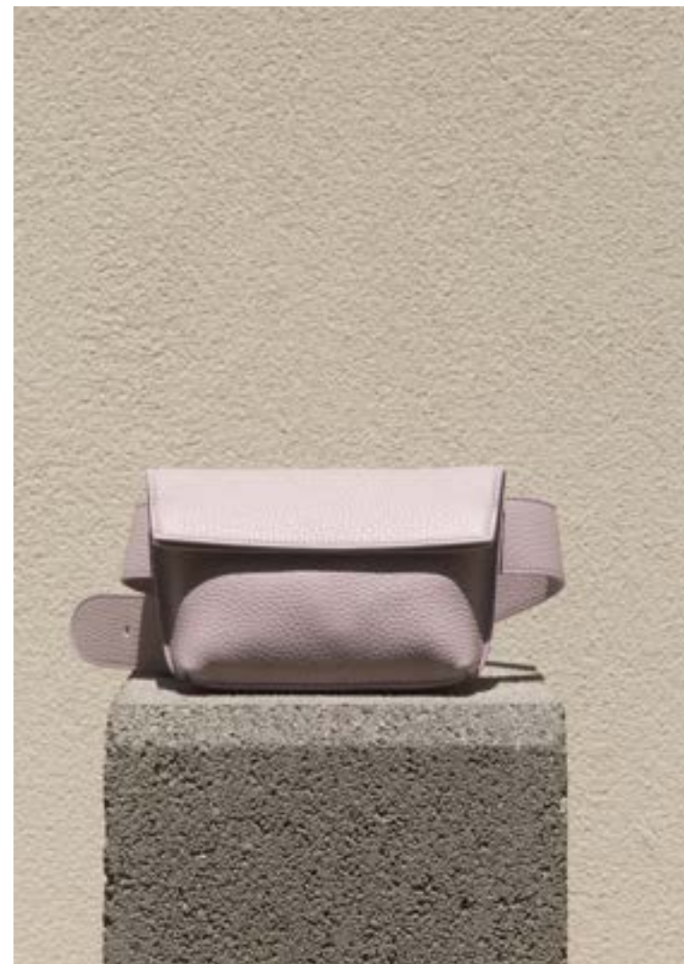
YARI RIO LAVENDER WHS: 184 € / RRP: 460 €