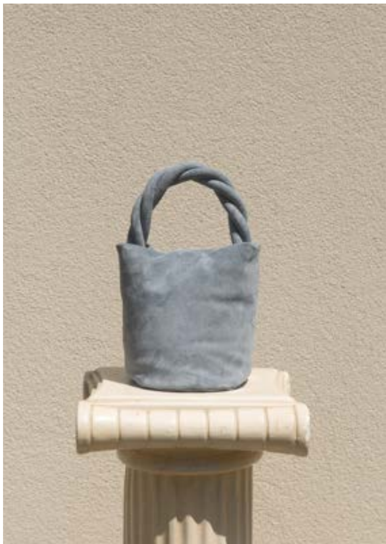
JOHANNA MINI BUCKET SUEDE SAVOIA WHS: 206 € / RRP: 515 €