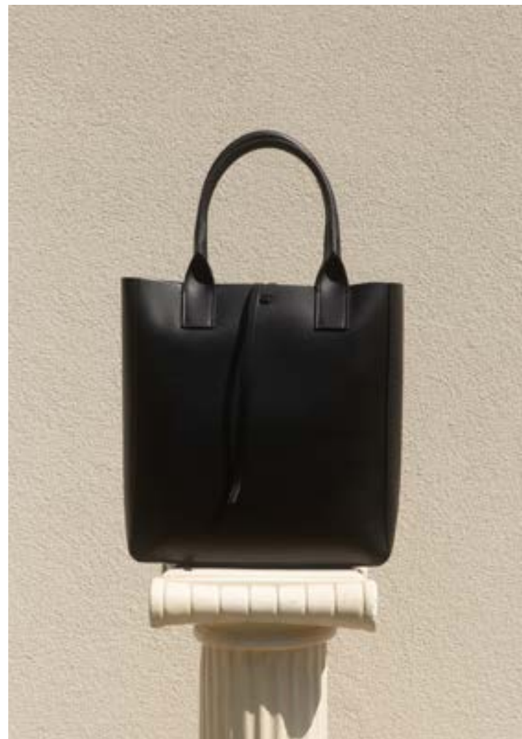
FILIPPO BAG VITELLO BLACK WHS: 334 € / RRP: 835 €