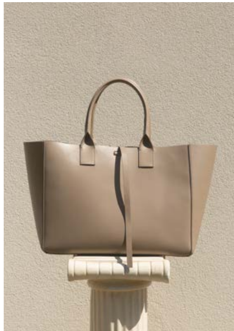
LARGE FILIPPO BAG VITELLO STONE WHS: 420 € / RRP: 1050 €