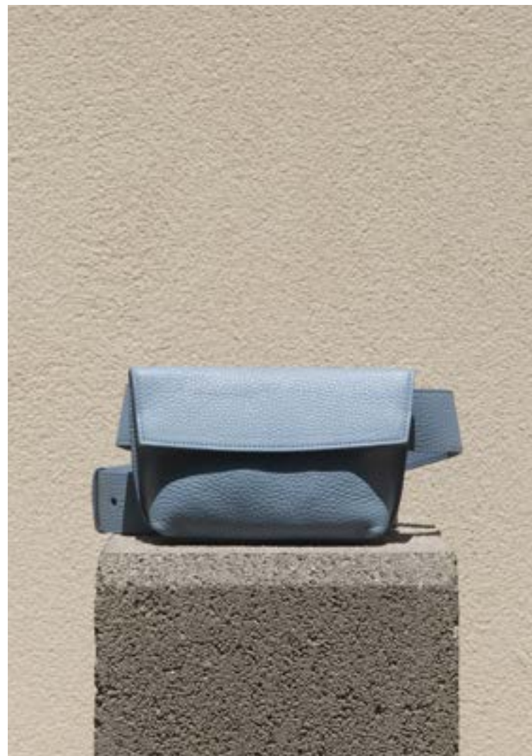
YARI RIO SAVOIA WHS: 184 € / RRP: 460 €