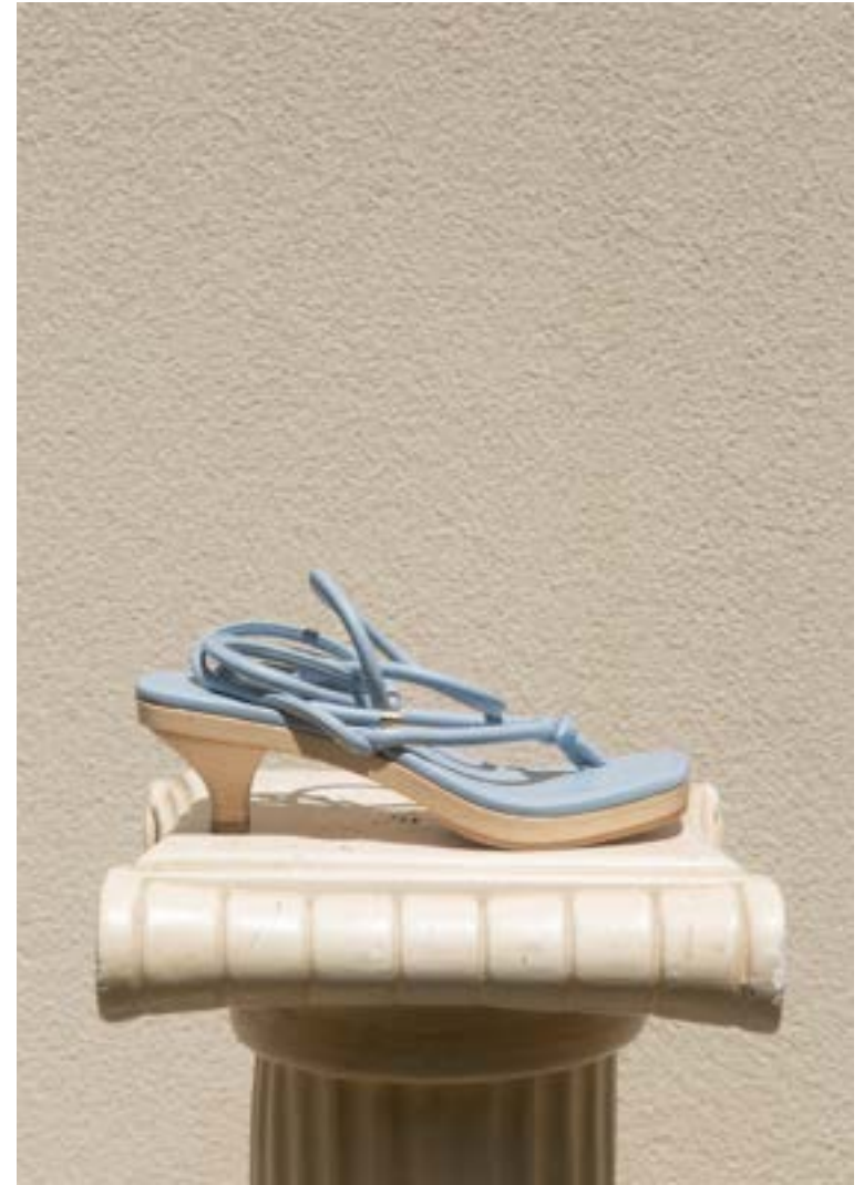
GIANA SANDAL STRAP SAVOIA WHS: 170 € / RRP: 430 €