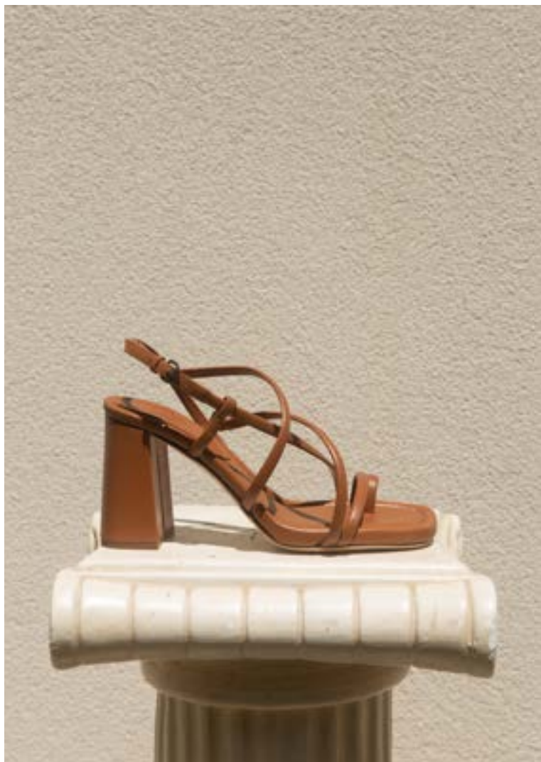
BENEDETTA SANDAL AMBRA WHS: 204 € / RRP: 510 €