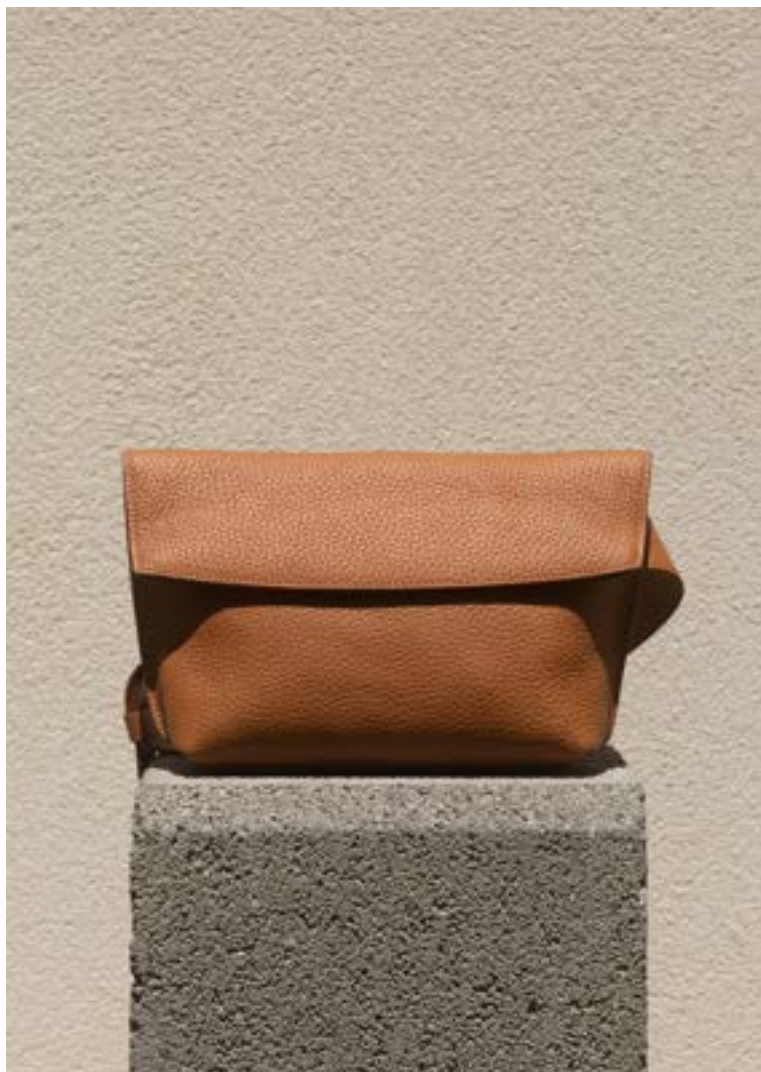
LARGE YARI RIO AMBRA WHS: 225 € / RRP: 565 €