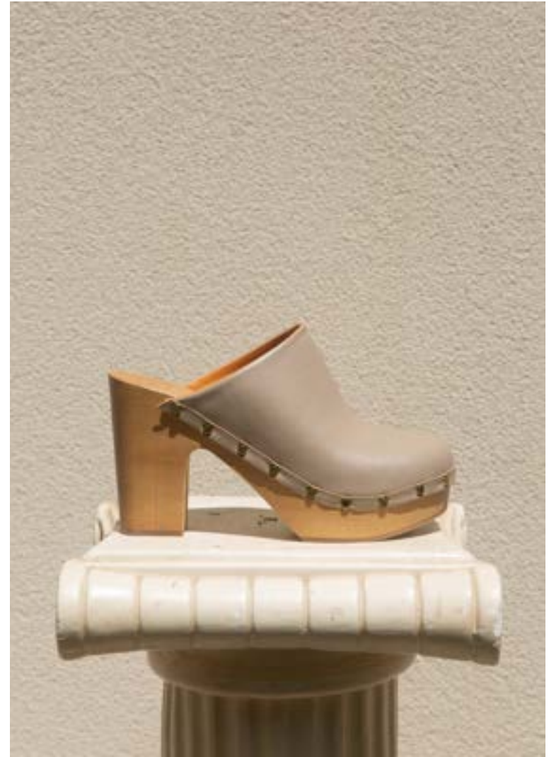
PERNILLE CLOG LIGHT WHS: 172 € / RRP: 430 €